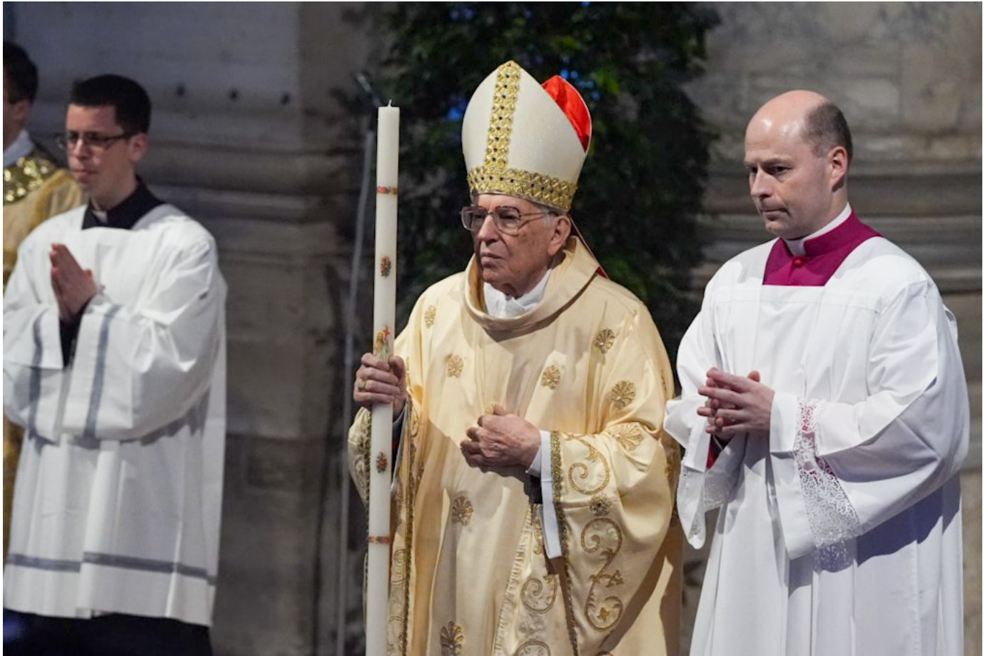
Cardinal Giovanni Battista Re, dean of the College of Cardinals, processes into St. Peter's Basilica at the beginning of the Easter Vigil Mass at the Vatican April 19, 2025.