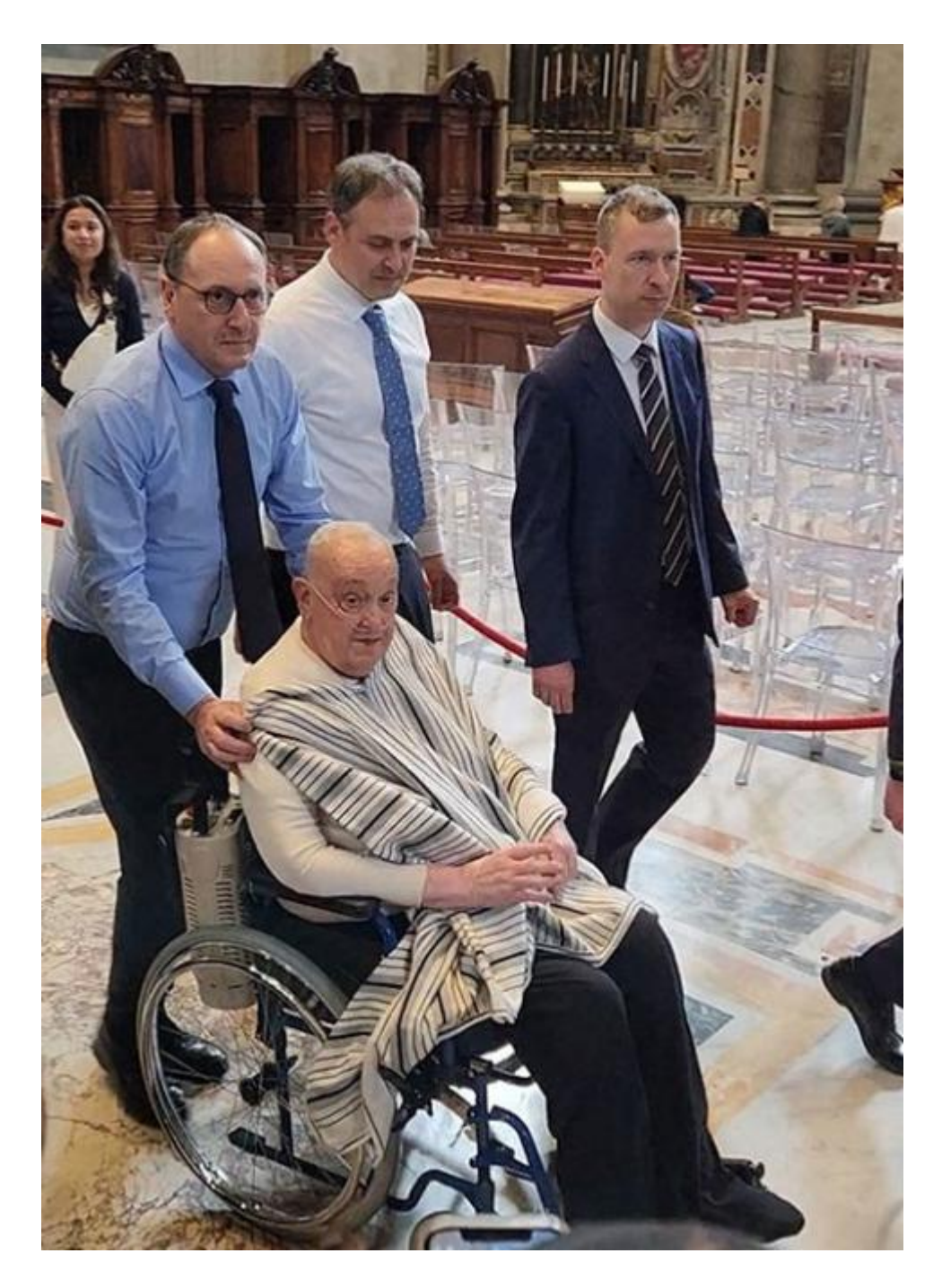
Pope Francis makes a surprise visit to St. Peter's Basilica at the Vatican to pray April 10, 2025.

Francis' two feet stood firmly on sacred ground: one planted in the long tradition of sacramental seeing — a way of beholding creation with wonder and gratitude, finding God in beauty, fragility and form. The other grounded in sacred Scripture, especially the radical, often uncomfortable Gospel call to justice, humility and mercy. He was never content to leave the Beatitudes on the page. He lived them.