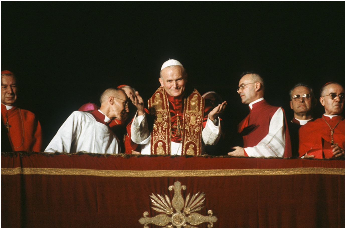
Pope John Paul II appears on the balcony at St. Peter's Basilica following his election to head the Catholic Church on Oct. 16, 1978.

ten years before becoming archbishop of Florence in 1977. But, Benelli was the kingmaker, not the king, in the August gathering. His candidate, the patriarch of Venice, Albino Luciani, was elected on the fourth ballot. He took the name John Paul I but died about a month later.