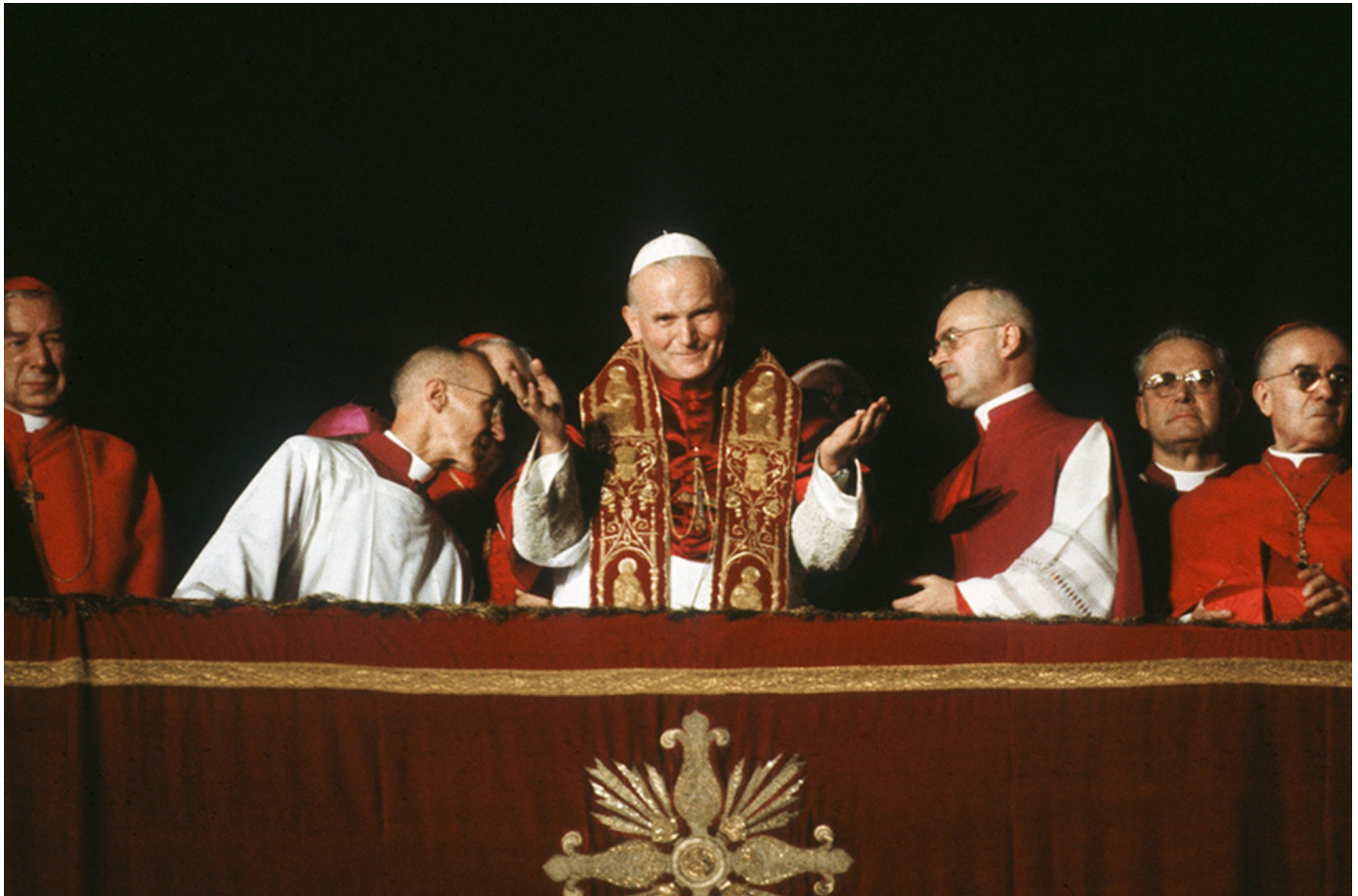
Pope John Paul II appears on the balcony at St. Peter's Basilica following his election to head the Catholic Church on Oct. 16, 1978.

ten years before becoming archbishop of Florence in 1977. But, Benelli was the kingmaker, not the king, in the August gathering. His candidate, the patriarch of Venice, Albino Luciani, was elected on the fourth ballot. He took the name John Paul I but died about a month later.