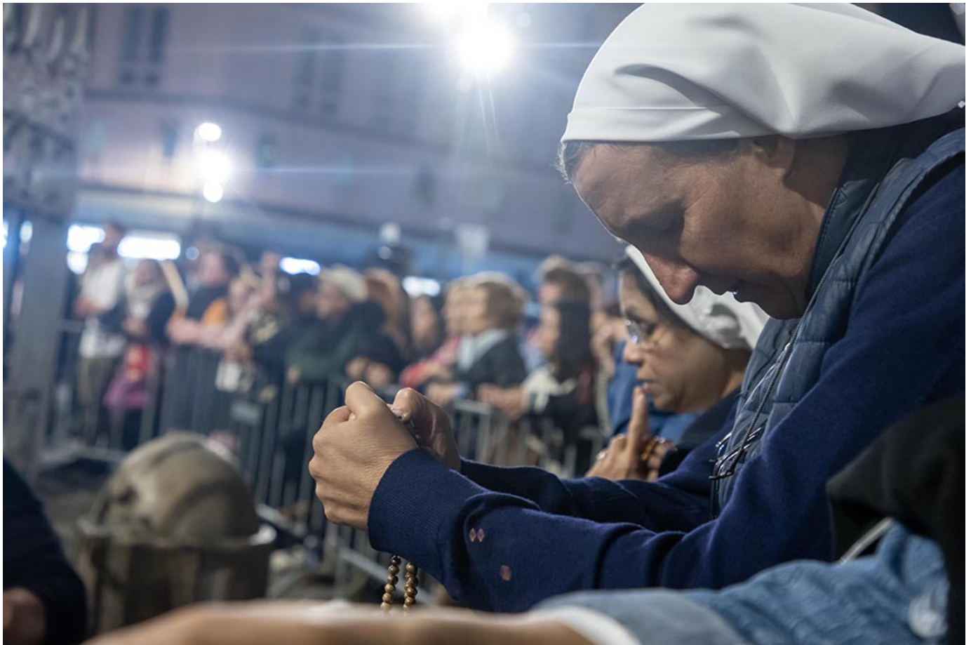
People gather to pray the rosary for the repose of the soul of Pope Francis April 24, 2025, at Rome's Basilica of St. Mary Major.

The days of Lent — 40 days and six Sundays — are a good opportunity and a wake-up call for me to slow down. I try to listen to my own restlessness and find my rest in God, becoming revitalized and creative. When I actively listen, I deeply connect with my own journey and, in the process, I see the presence of God amid my everyday, ordinary, simple life. The radical following of Christ invites me to break boundaries and reach out in love, accepting hardships along the way. To be free, I must shed attachments to material things and stability, which gives me more space, time and energy to discover myself and God. We are all interconnected, and when I am free, it becomes easier to connect with all God's creatures.