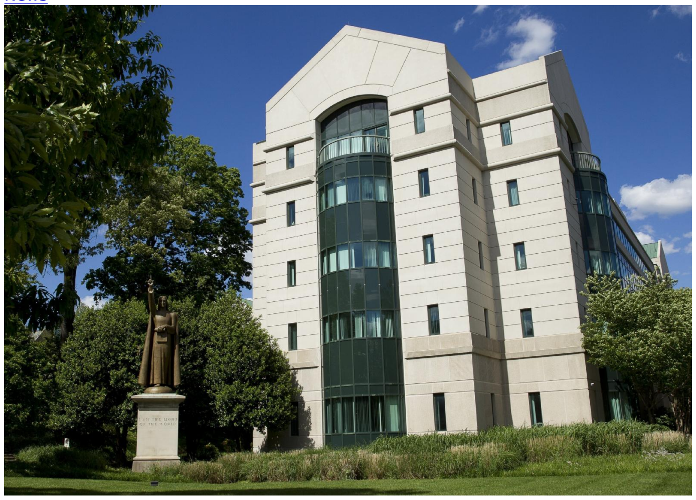
The U.S. Conference of Catholic Bishops building is seen in Washington May 8, 2017. The USCCB Secretariat of Child and Youth Protection released its 2024 annual report on findings and recommendations on implementation of the "Charter for the Protection of Children and Young People" on June 6, 2025.