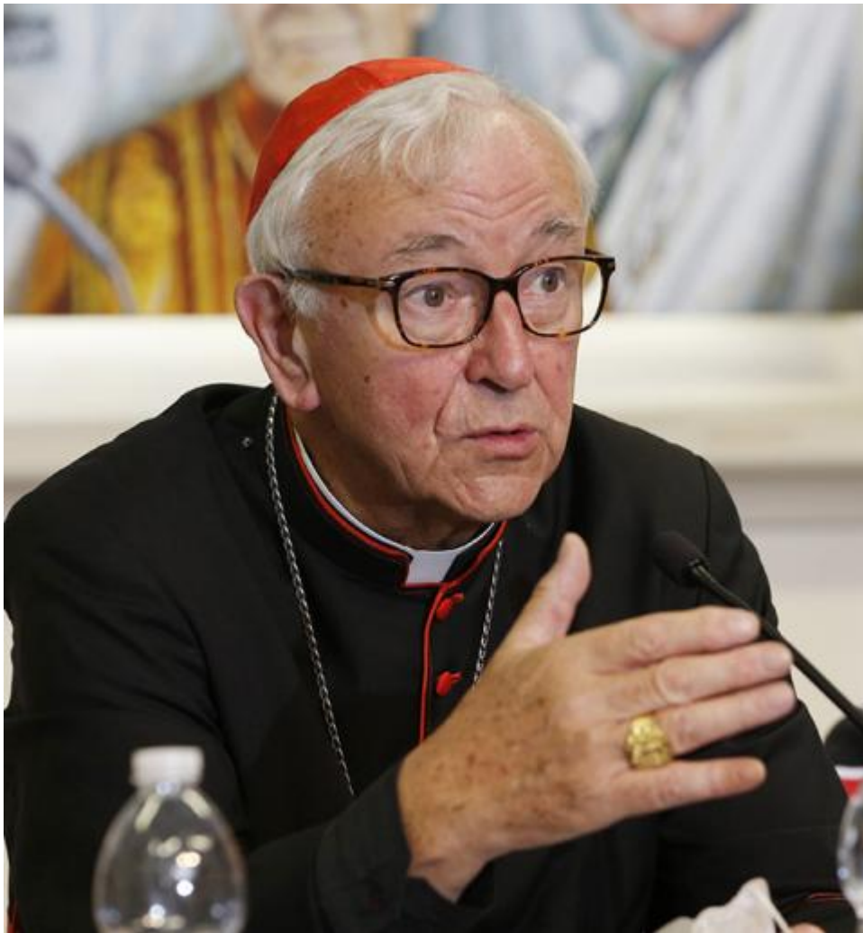
Cardinal Vincent Nichols of Westminster, England, is pictured May 19, 2022.

Not surprisingly, the latest laws have been vigorously opposed by British and French church leaders.