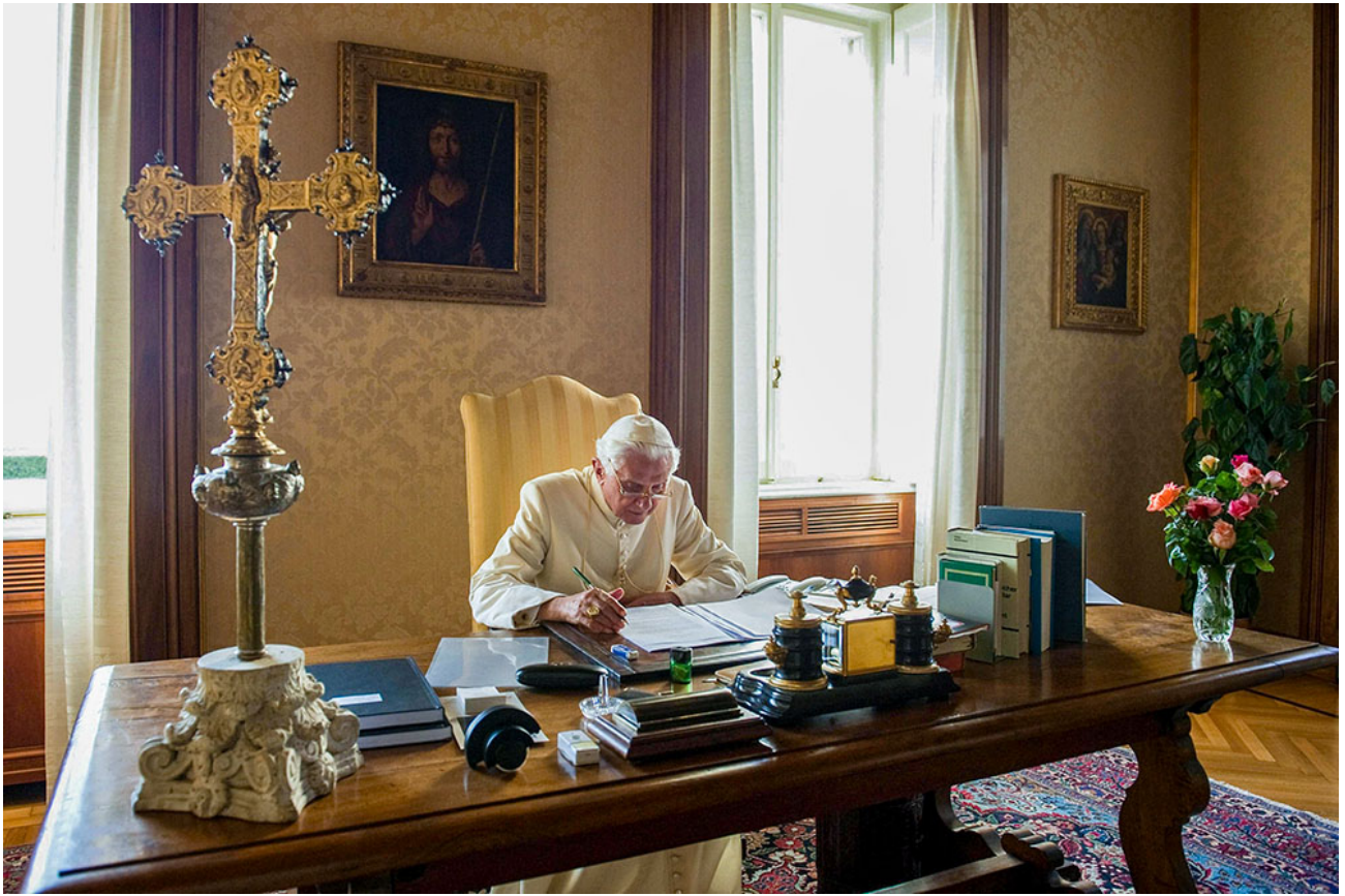
Pope Benedict XVI sits at his desk in the papal residence at Castel Gandolfo, Italy, in 2010.