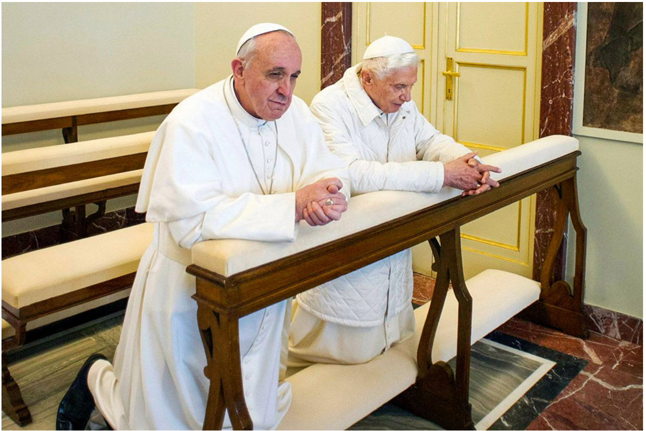
Pope Francis prays with retired Pope Benedict XVI at the papal summer residence in Castel Gandolfo, Italy, March 23, 2013.

The German pontiff spent time during his eight-year pontificate at the hillside retreat, away from Rome. Notably, in 2010, he flew by helicopter to Castel Gandolfo to work on his book Jesus of Nazareth: The Infancy Narratives .