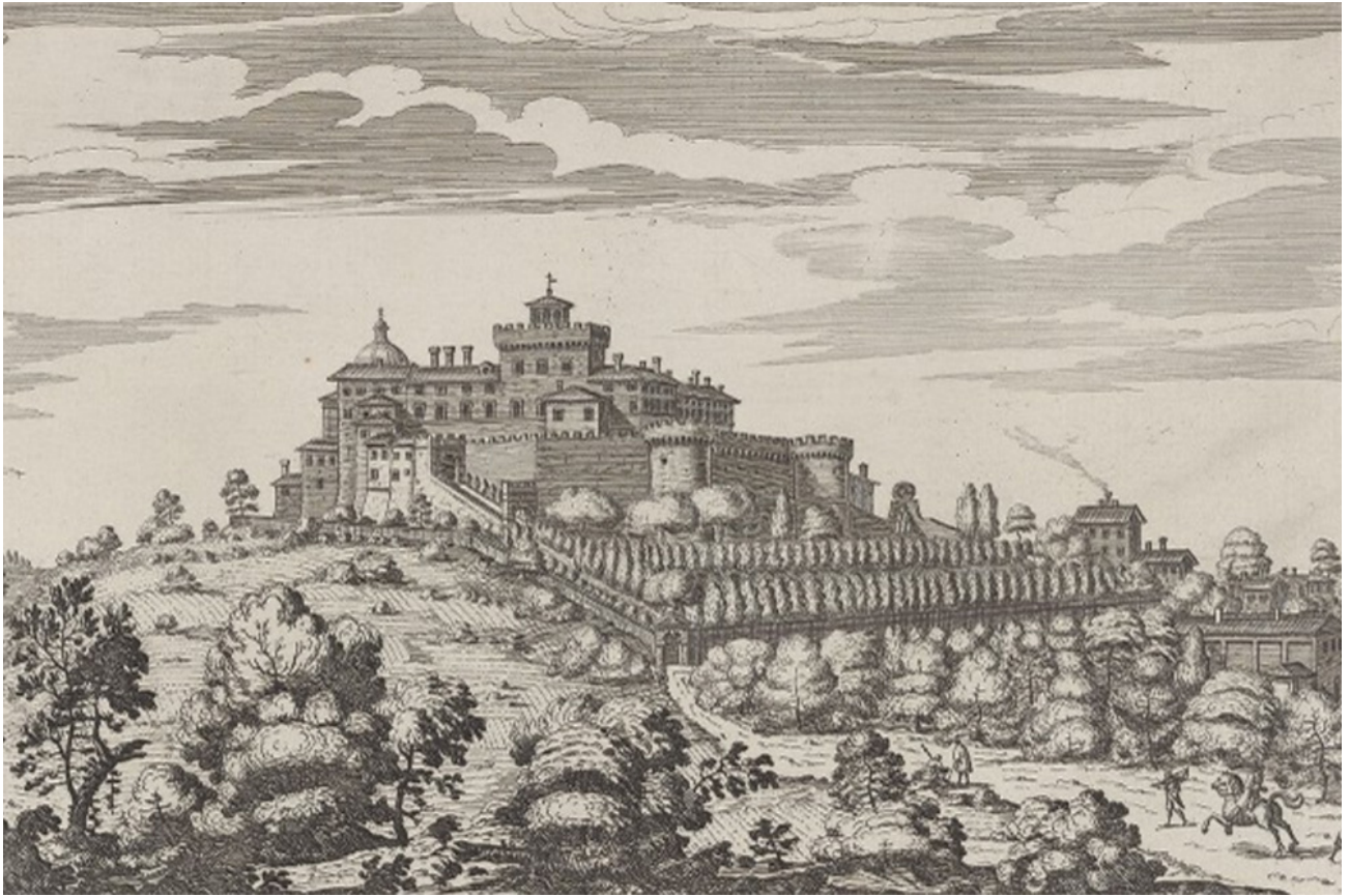
View of the palace and gardens of the Castle Gandolfo, in a detail from a 1665 etching by Giovanni Battista Falda