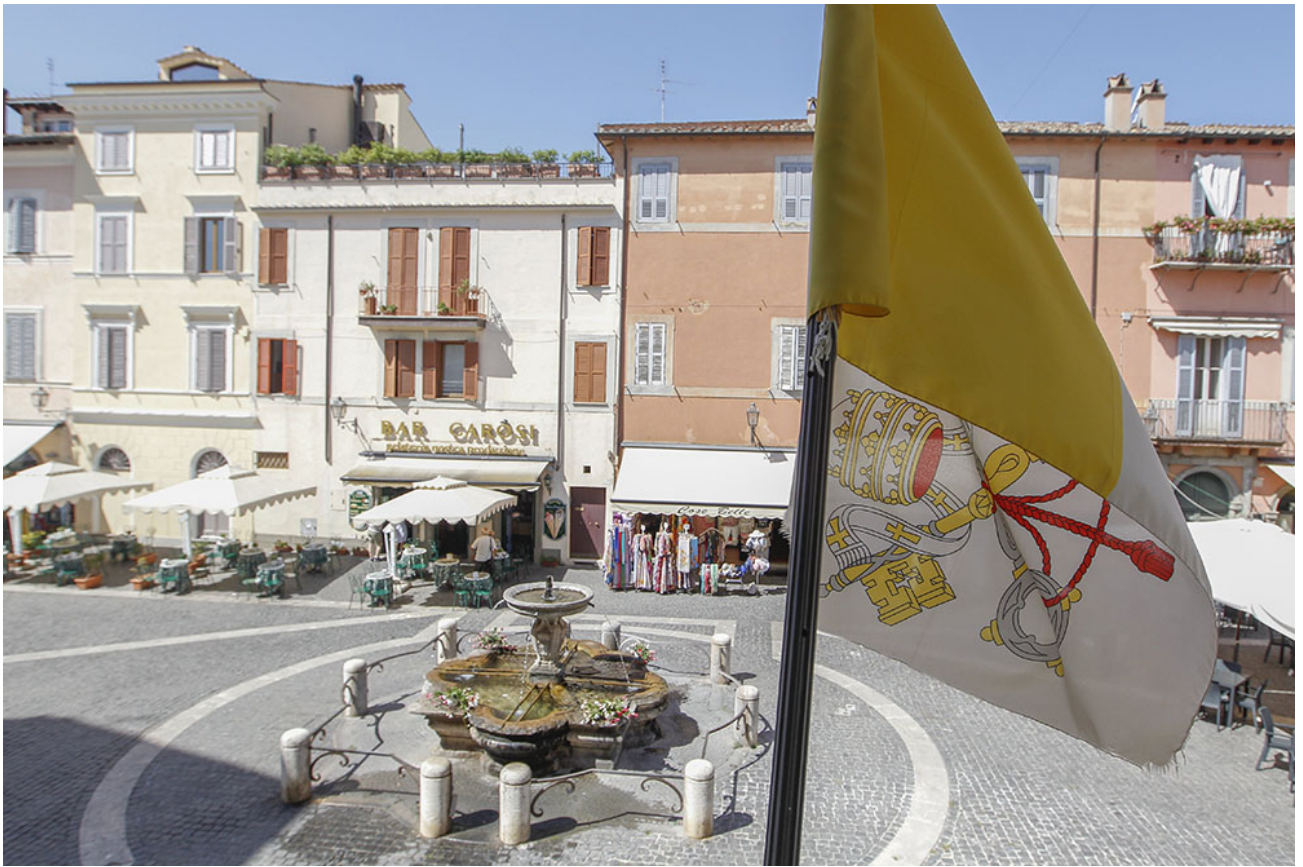
The Vatican flag flies over the main square in Castel Gandolfo, Italy, Aug. 14, 2020.