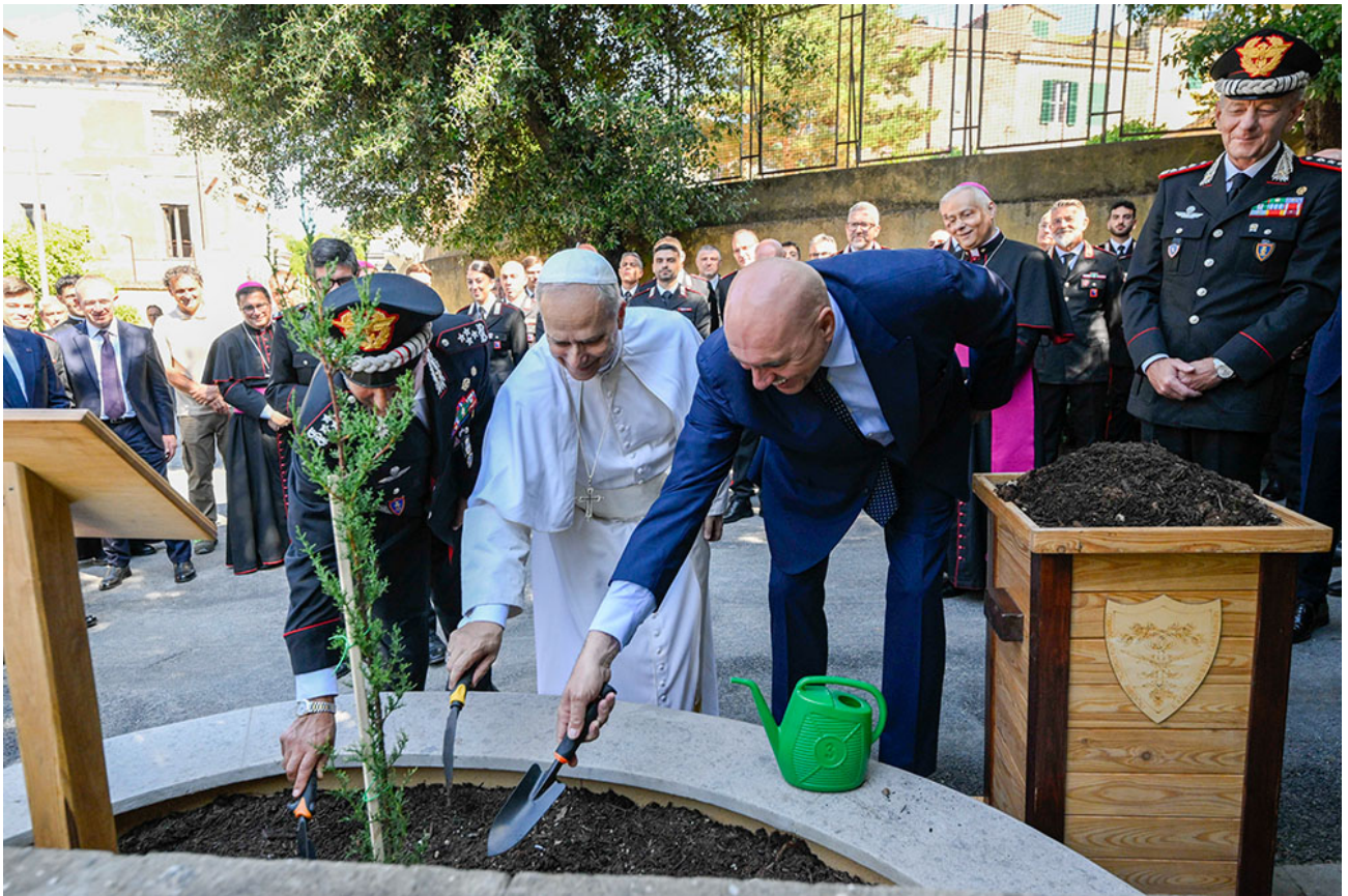
Pope Leo XIV takes part in a tree-planting ceremony with top officers of the Italian Carabinieri at their headquarters in Castel Gandolfo July 15, 2025.

Instead of staying at the Apostolic Palace in Castel Gandolfo, Leo XIV stayed in a renovated apartment in the town's Villa Barberini, a section of gardens, during his visit this July. The visit was originally scheduled for July 6-20 , but he extended it on July 20 for two more days. He plans to return to Castel Gandolfo again Aug. 15-17, the Vatican has said.