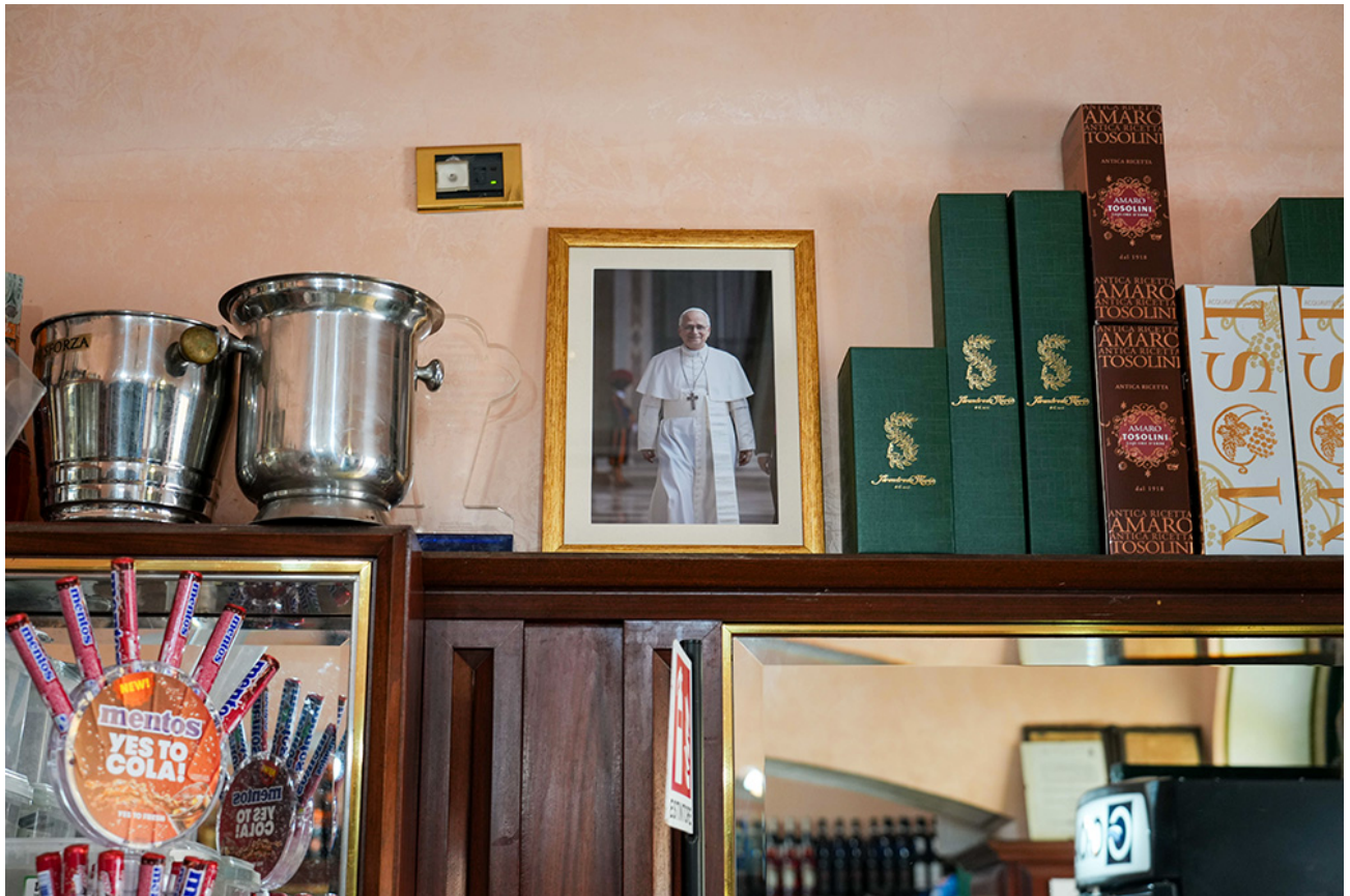
A framed photo of Pope Leo XIV is displayed inside a local café on the main square of Castel Gandolfo, Italy, July 1, 2025.