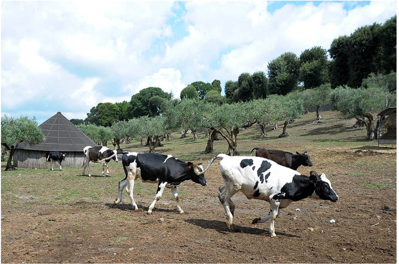
Cows are seen on the farm at the papal villa at Castel Gandolfo, Italy, in an undated photo.