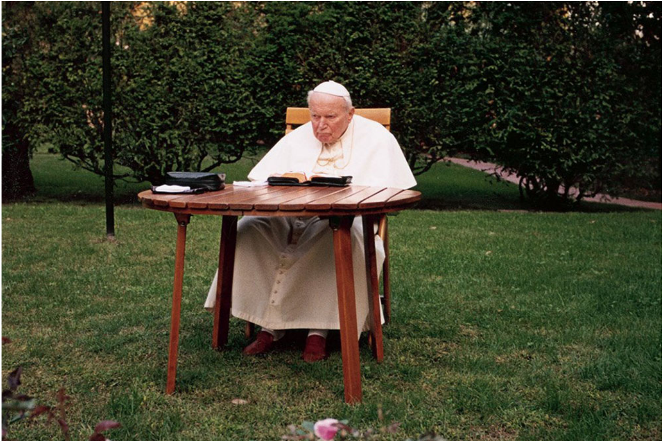
Pope John Paul II prays in the garden at his summer residence of Castel Gandolfo, Italy, Sept. 19, 2004.