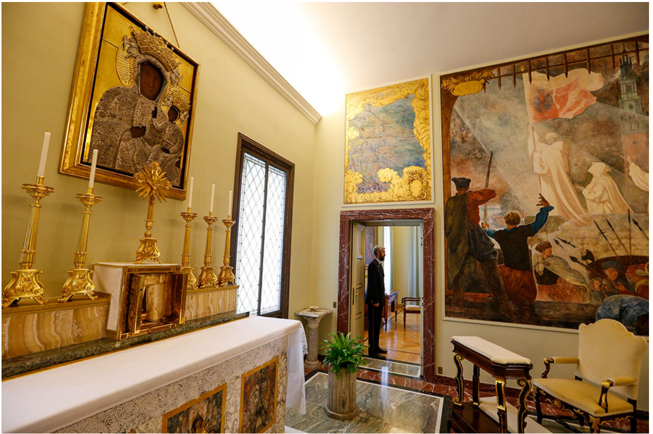
A chapel is seen in the papal villa at Castel Gandolfo, Italy, in 2016.