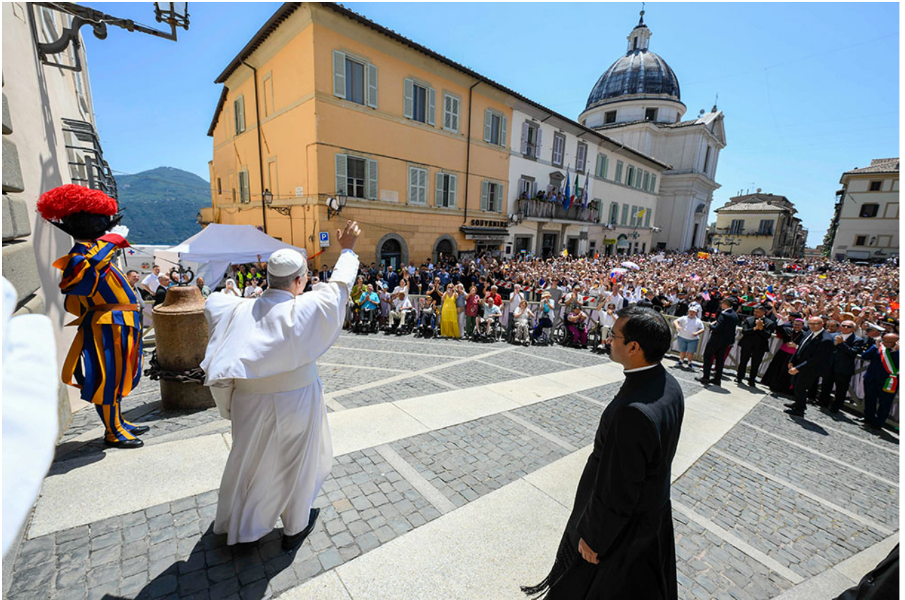
Pope Leo XIV greets visitors at the conclusion of the Angelus in Castel Gandolfo, Italy, July 20, 2025.