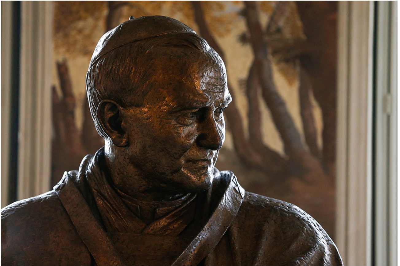
A bust of St. John Paul II decorates a room of the papal villa at Castel Gandolfo, Italy, in 2016.

His relationship with the pontifical villa began before he was even elected pope. As a cardinal in Rome for the second conclave of 1978 , Karol Wojtyla spent some days of rest and reflection at Castel Gandolfo. Eight days later, on Oct. 16, he became pope.