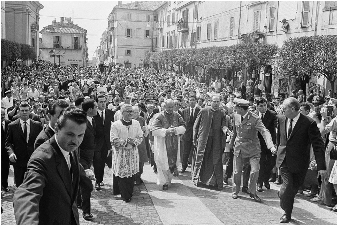
Pope Paul VI, center, is followed by a crowd as he walks the short distance from the local parish church, St. Thomas of Villanova, to the papal summer residence in Castel Gandolfo, Italy, Aug. 15, 1965.