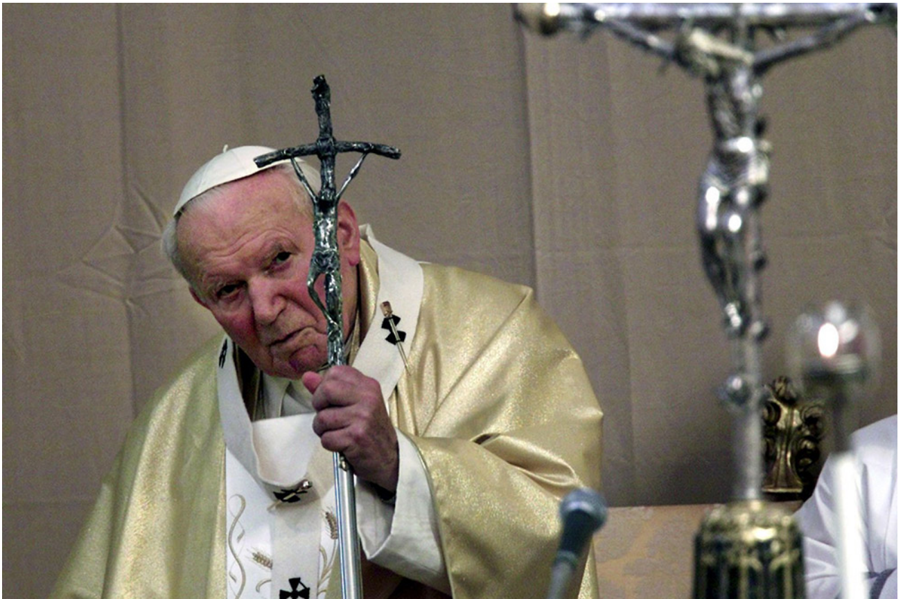
Pope John Paul II celebrates Mass on the feast of the Assumption Aug. 15, 2001, in a courtyard of the papal summer residence in Castel Gandolfo, Italy.