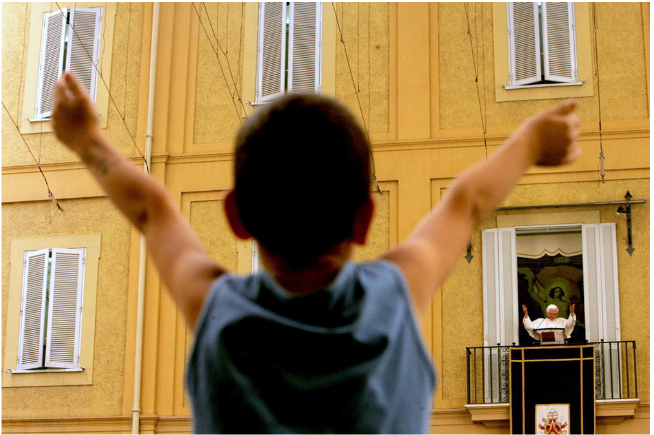
Pope Benedict XVI waves to the faithful gathered for the Angelus at the pontiff's summer residence in Castel Gandolfo, Italy, Aug. 20, 2006.