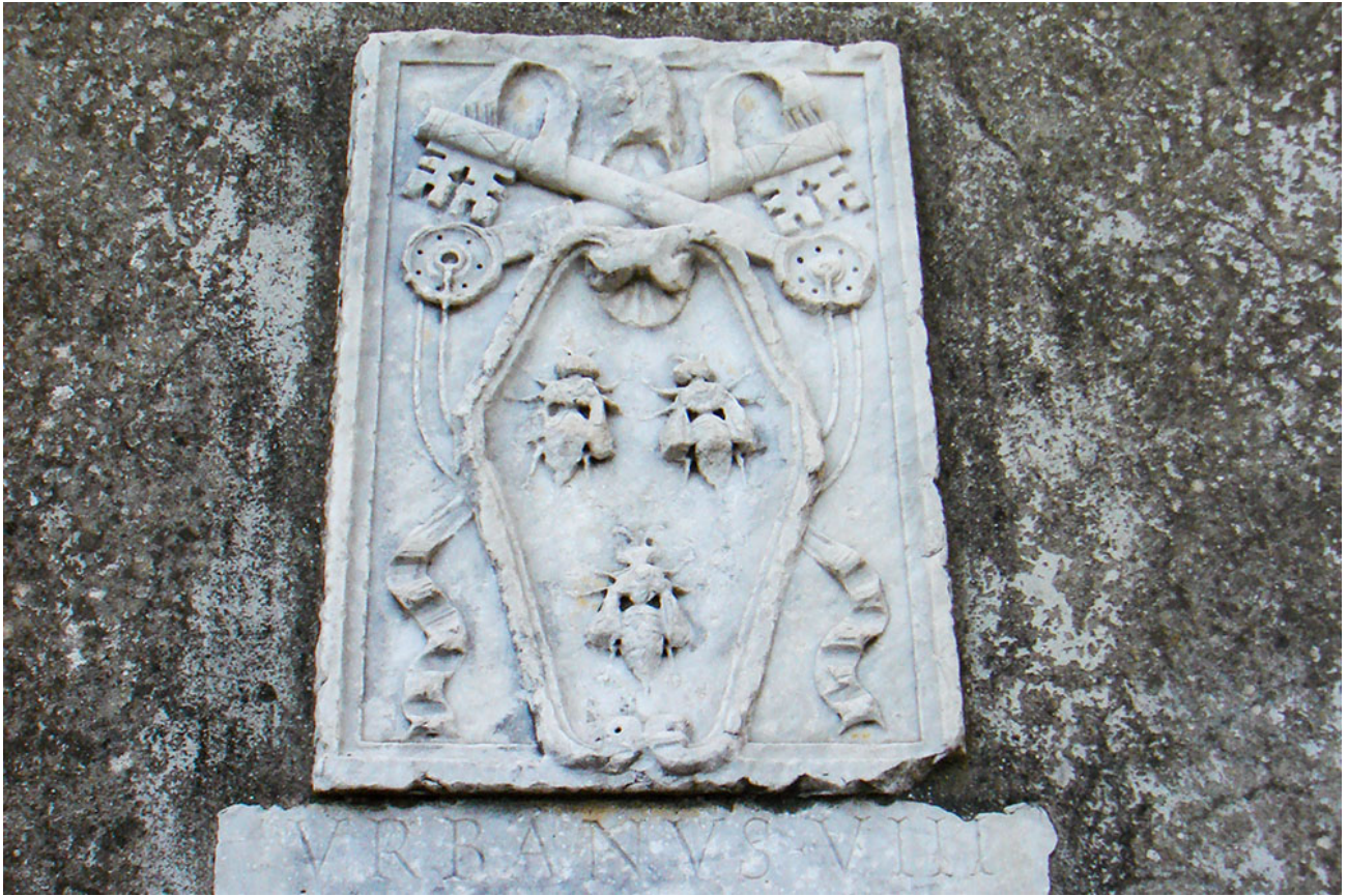
The papal coat of arms of Pope Urban VIII is seen on a wall in Castel Gandolfo, Italy.

Jumping back some 400 years, we find the man who first began the tradition of the popes summering in the residence at Castel Gandolfo: Urban VIII. Beginning in 1626, he returned there for 11 years, traveling to the lakeside town twice a year for two to three weeks at a time.