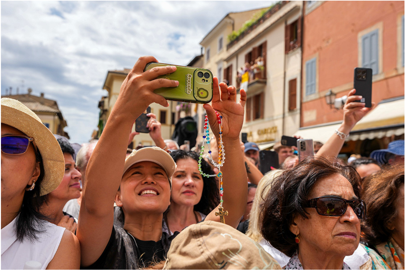
Visitors join Pope Leo XIV as he delivers his first Angelus from Castel Gandolfo, Italy, July 13, 2025.