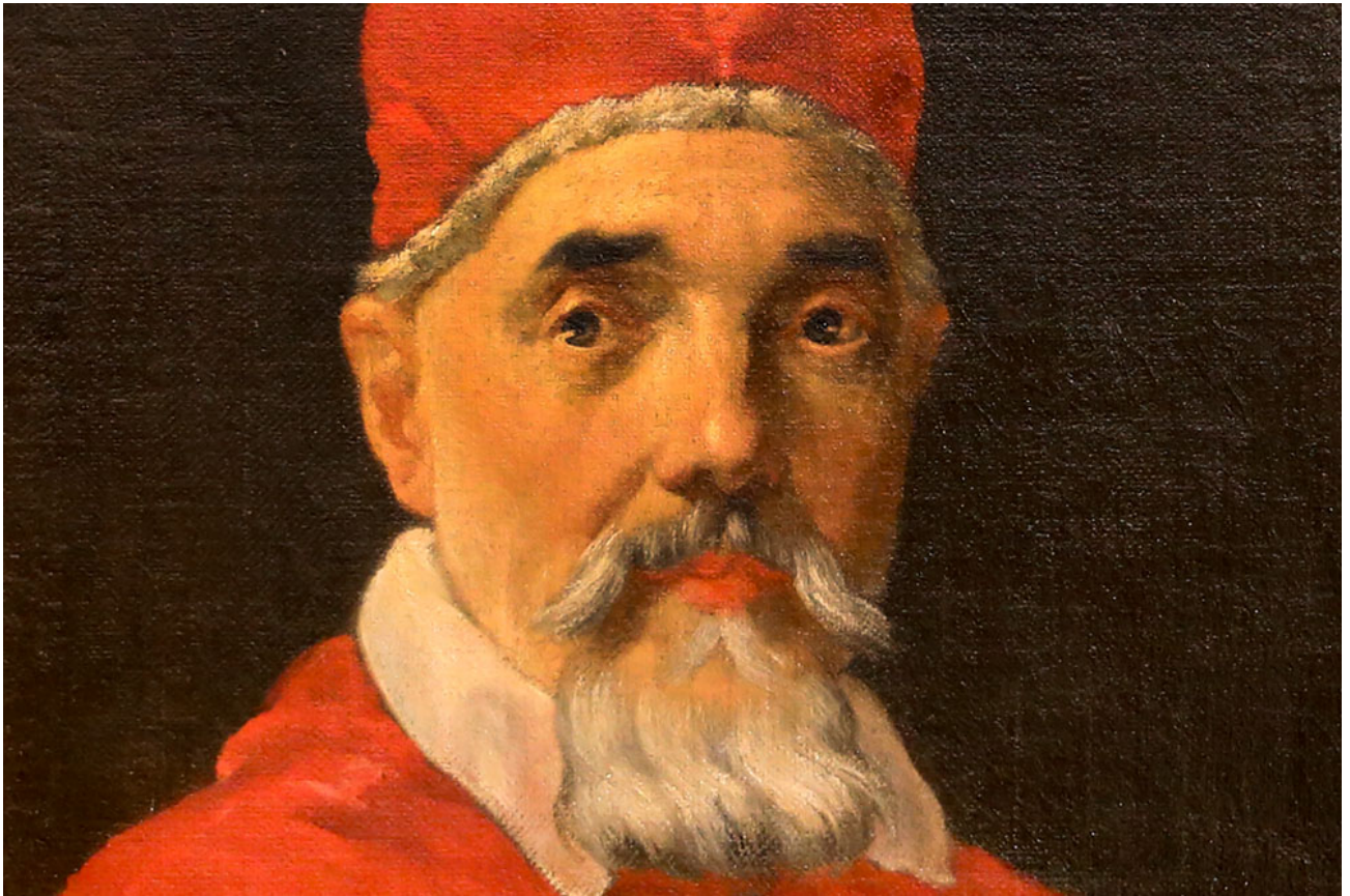
Detail of a portrait of Pope Urban VIII by Gian Lorenzo Bernini, painted circa 1631-32