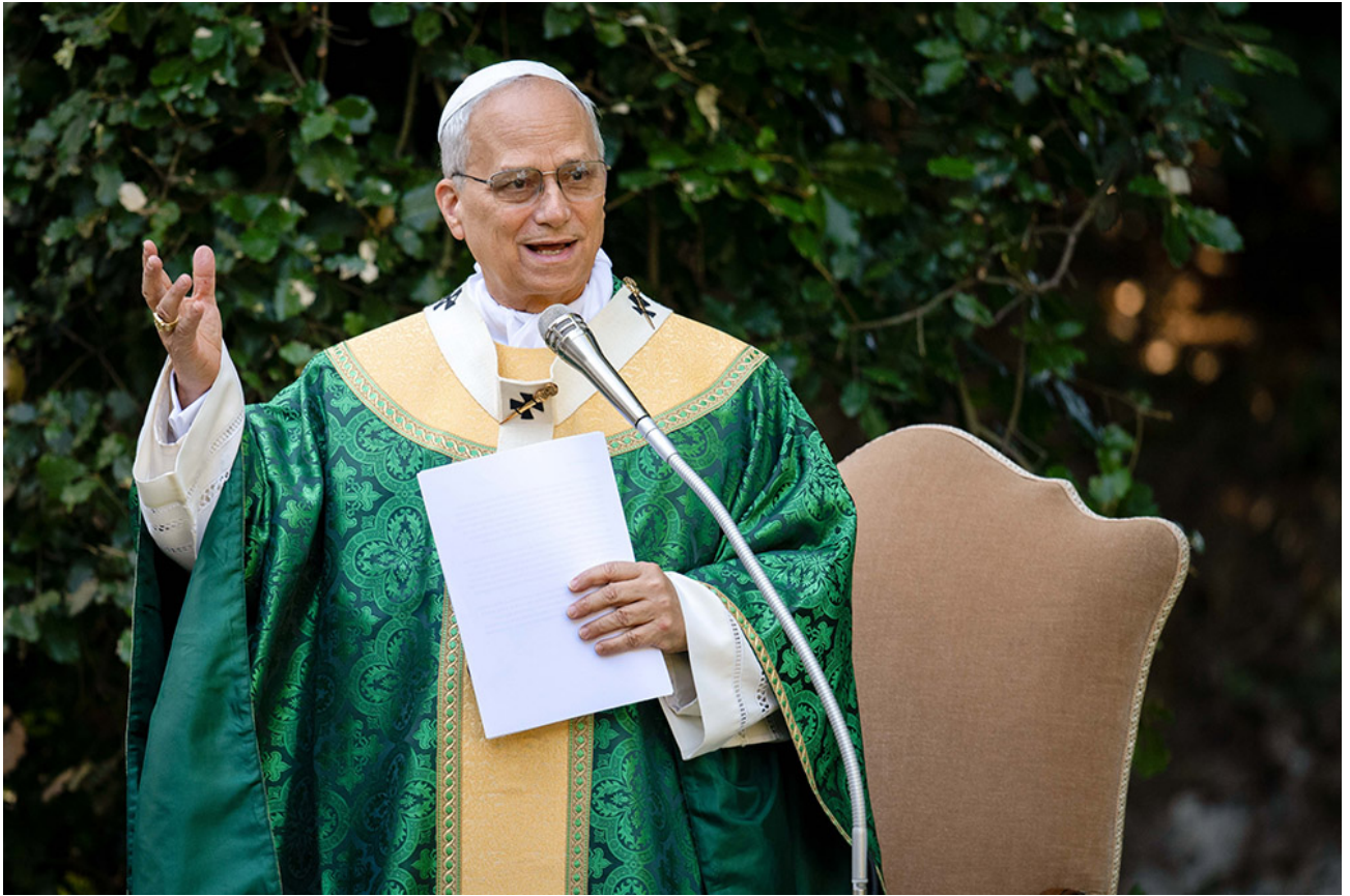
Pope Leo XIV celebrates Mass for the Care of Creation on the grounds of the Borgo Laudato Si' ecology center in Castel Gandolfo, Italy, July 9, 2025.