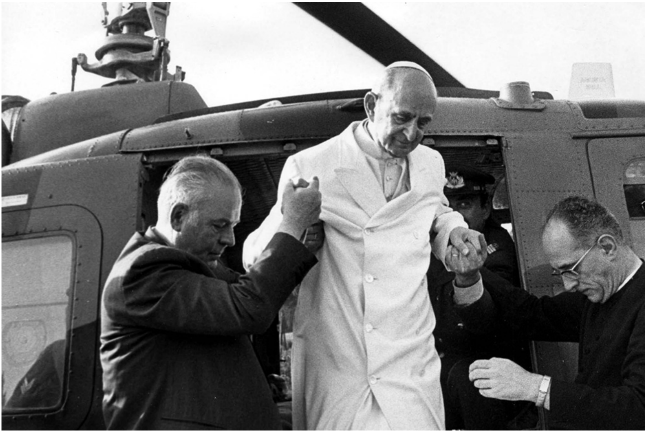
Vatican aides help Pope Paul VI out of a helicopter on his arrival at his summer residence in Castel Gandolfo, July 17, 1975, from Vatican City.