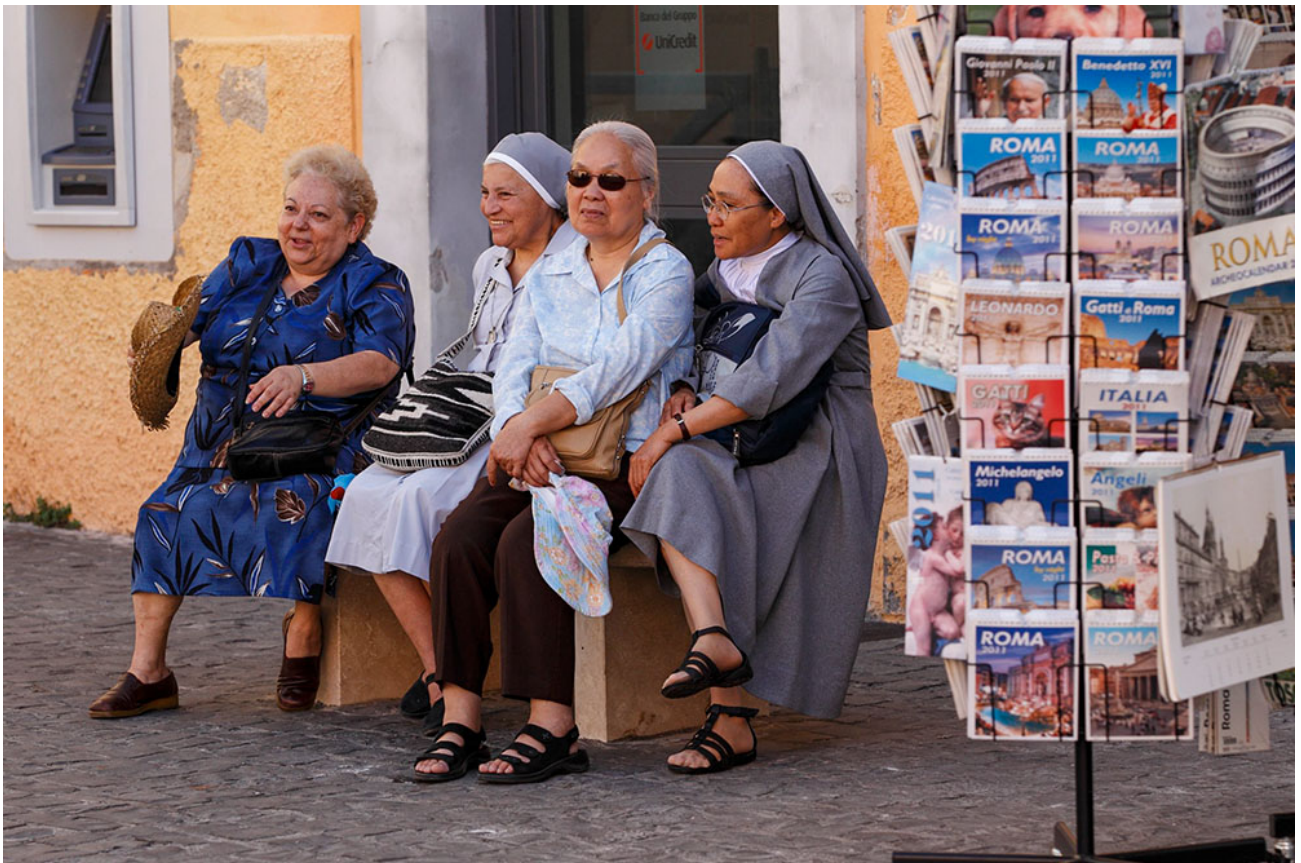
Pilgrims wait outside the papal villa for Pope Benedict XVI's Angelus prayer at Castel Gandolfo, Italy, July 18, 2010.

So how did a family castle become part of the pontifical villas?