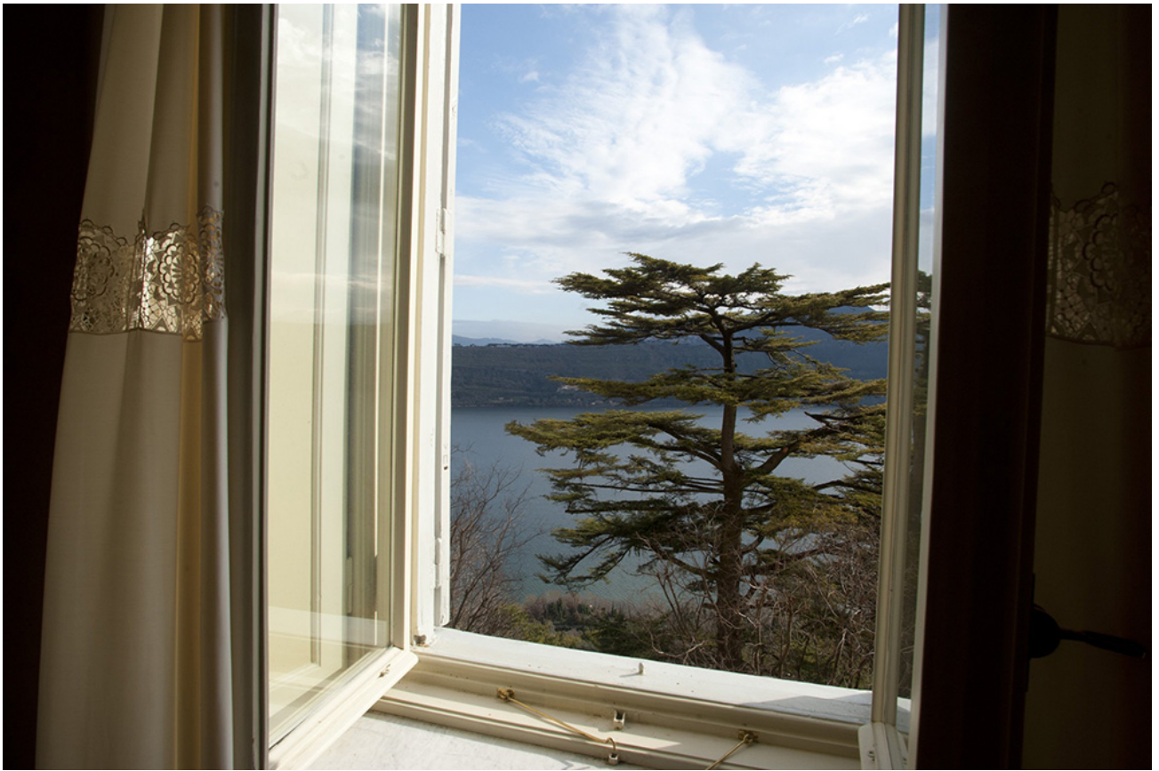
• Lake Albano is seen from a window of the papal villa in Castel Gandolfo, Italy, on Feb. 22, 2013.