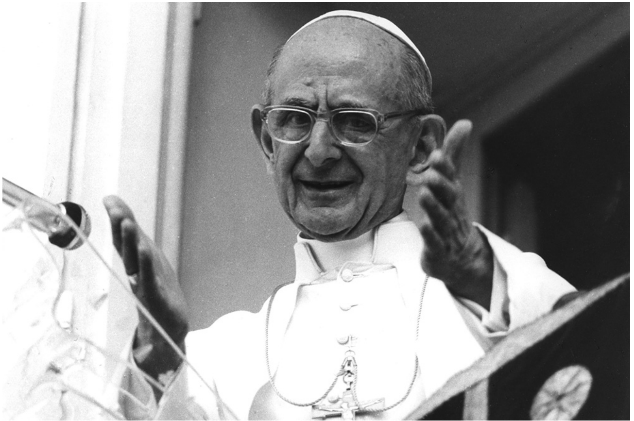
Pope Paul VI greets people gathered outside the papal summer house in Castel Gandolfo, Italy, Sept. 14, 1977.

Every year from mid-July to mid-September, Paul VI would spend time at Castel Gandolfo. During the Holy Year of 1975, rather than moving back full time to Rome, he chose to make weekly journeys by helicopter for his general audiences.