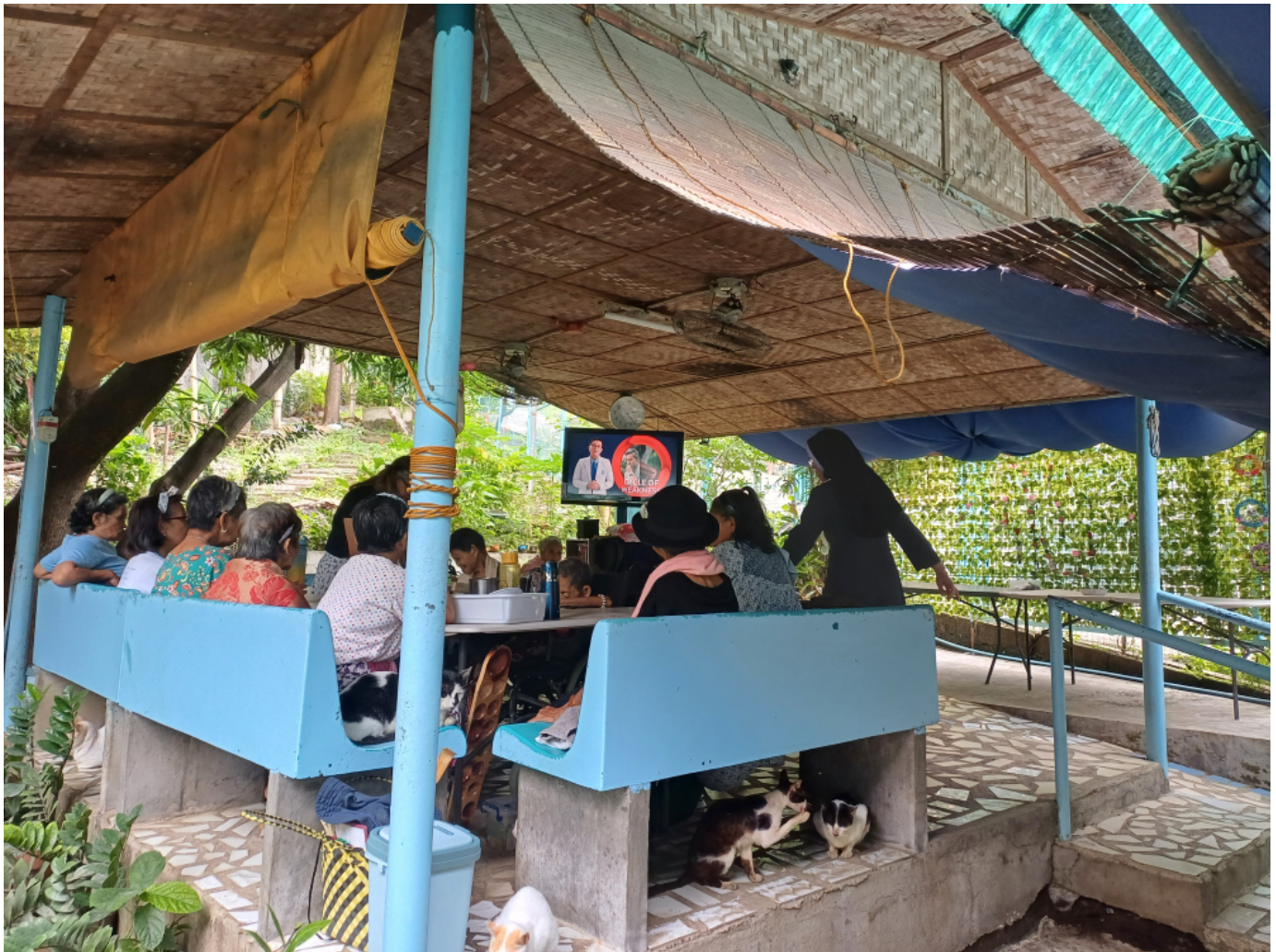
Residents of the Mary Mother of Mercy Home for the Elderly and Abandoned watch television in their kiosk in San Pedro, Laguna.

Our eldest resident is 93. She painted her mother's sunflower, which she has taken care of since she was young. Another resident painted two coffins, one representing the world that abandoned her, and the other representing when she leaves the shelter after her death.