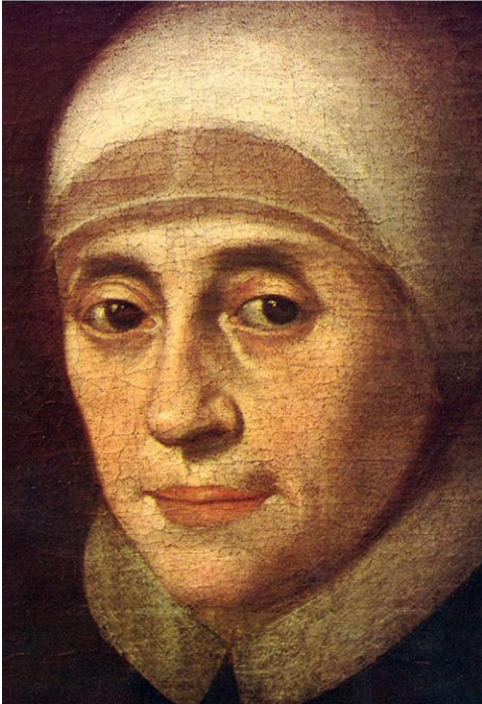
Sr. Mary Ward, pictured in an undated painting, is the founder of the Congregation of Jesus and the Institute of the Blessed Virgin Mary, known as the Loreto Sisters.

Pontificis , was imposed on the institute in 1631, while Ward was imprisoned by the Inquisition and accused of heresy. She died in her native England in 1645 with her life's work in ruins.