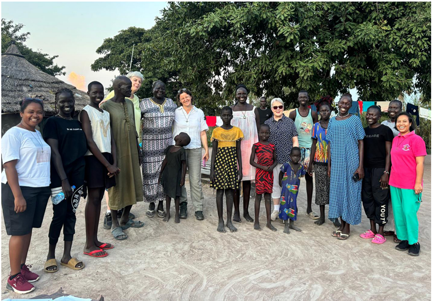
Sisters of Institute of the Blessed Virgin Mary and Congregation of Jesus meet local families at Loreto Rumbek, in South Sudan.