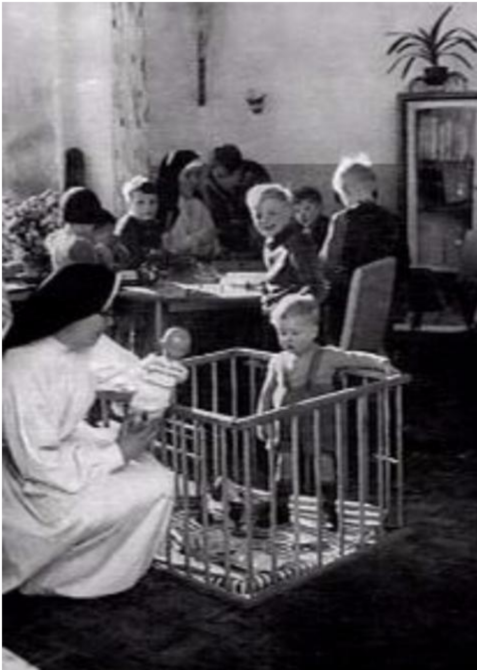
A children's village in Horn Netherlands, pictured in about 1950 (Bethany Dominicans)

Experiencing the overwhelming forgiveness and love of God is the spiritual bond among the sisters of Bethany, whether or not they have been in prison. They practice a tradition of privacy about their former lives, only sharing it if they choose to do so. Some use their past life and conversion as examples for those to whom they minister.