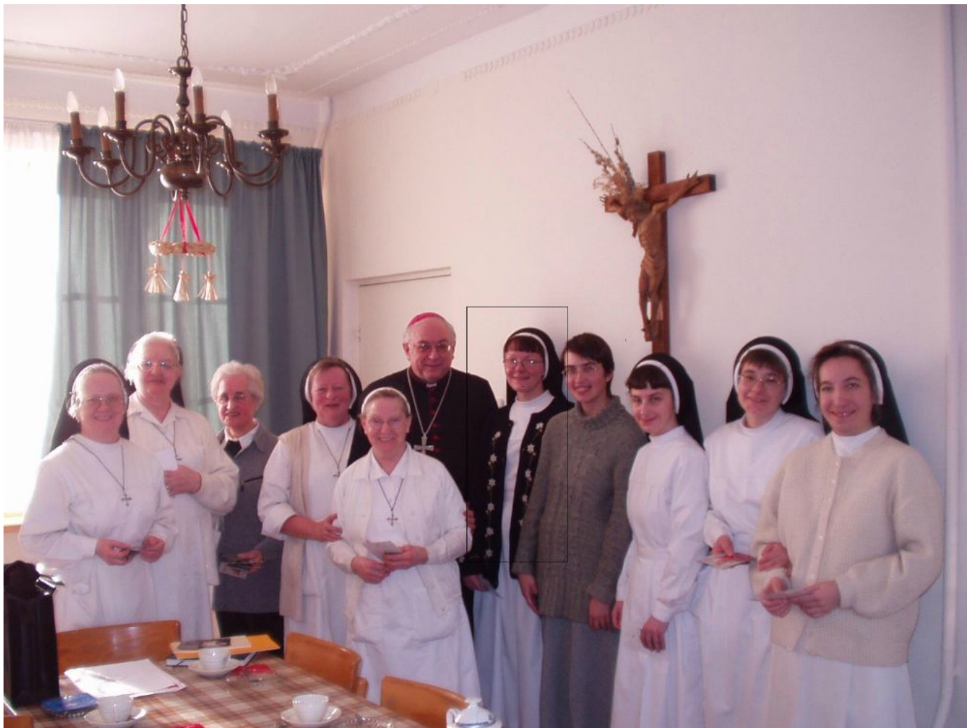
Bethany Dominican community pictured in Riga, Latvia, in 2003