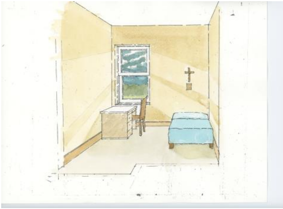
An artist's rendering of the proposed interior of nuns' rooms for the Cistercian Nuns of Valley of Our Lady Monastery

The new monastery, the sisters say, will promote their contemplative, cloistered way of life and be a witness to every facet of their Roman Catholic faith, which is built around liturgy, manual labor and the search for God through deep contemplative prayer.