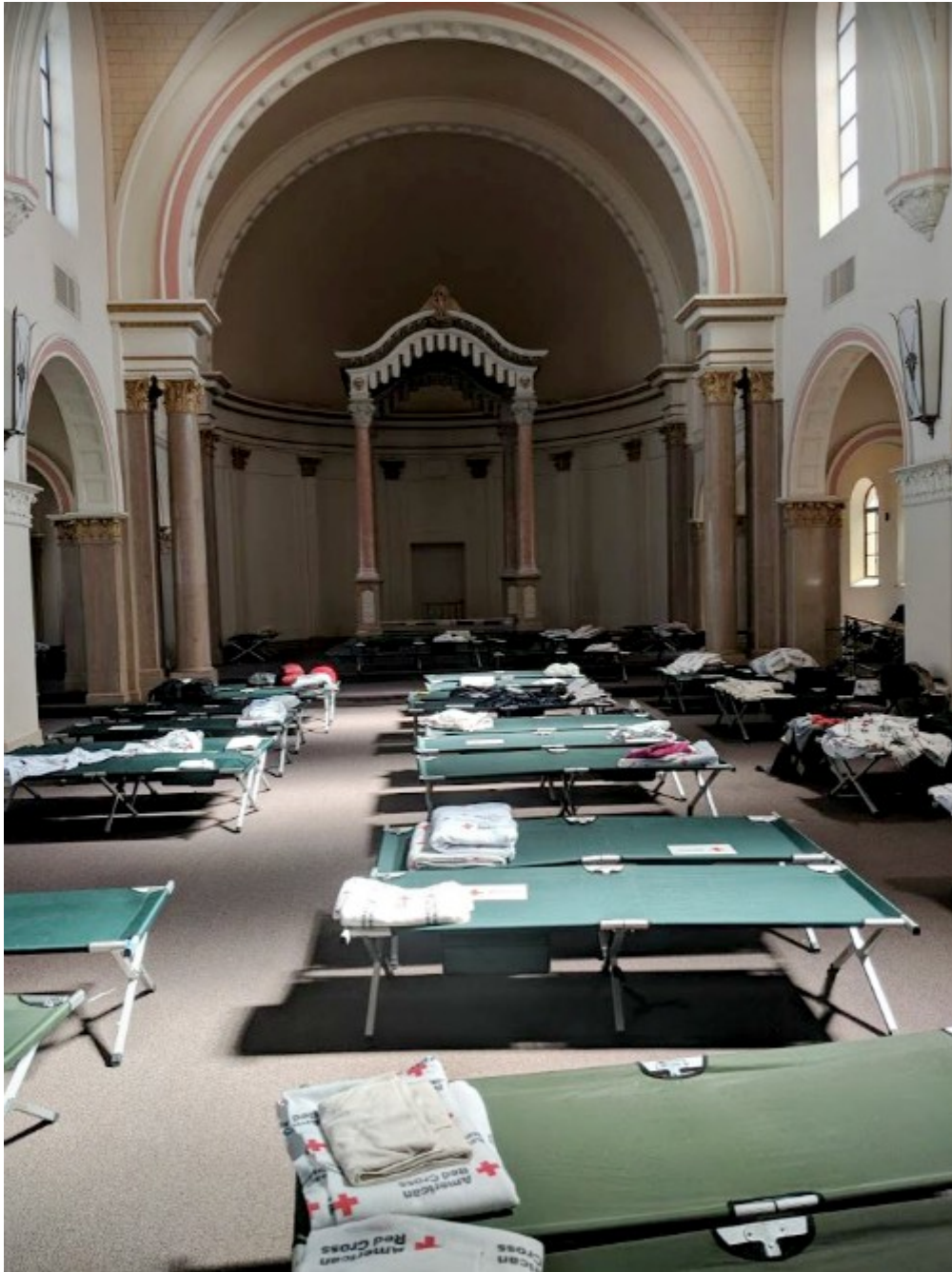
A sanctuary filled with cots for refugees is seen in Tucson, Arizona.