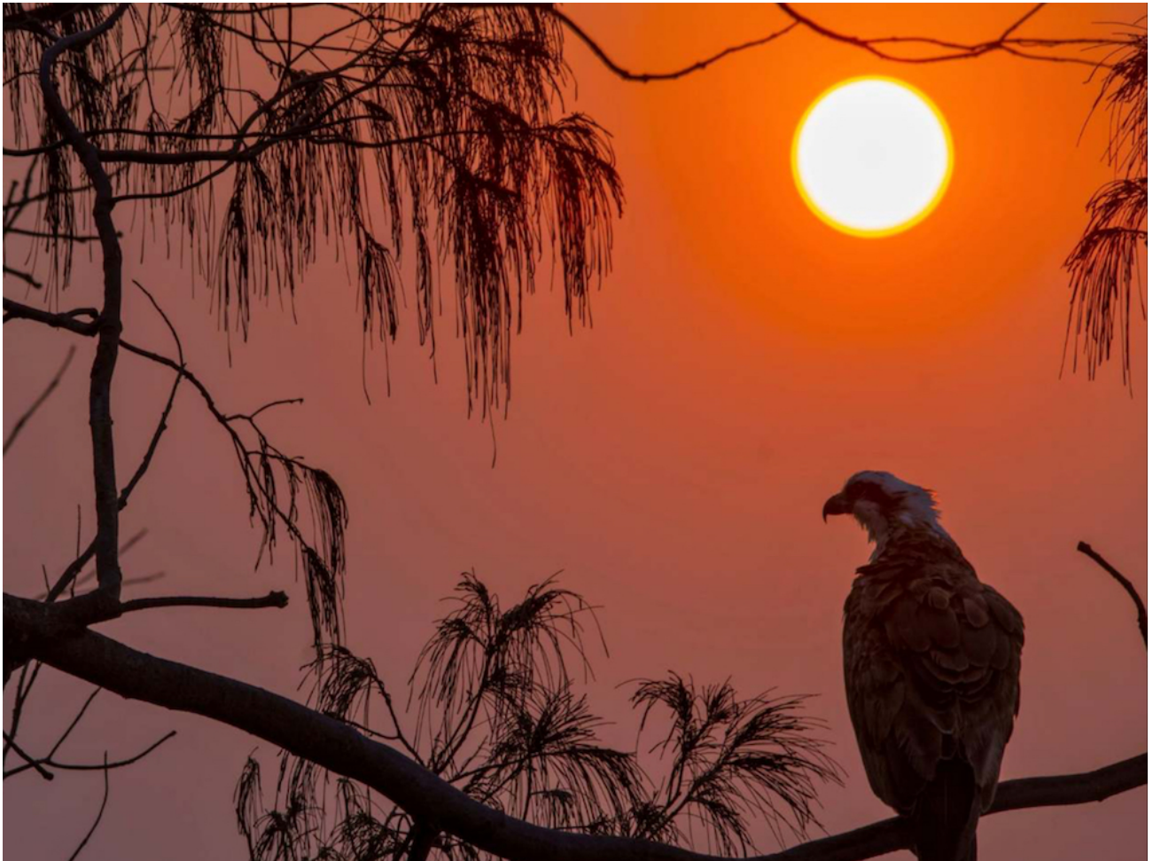
An osprey is seen against the smoke-filled sky at sunrise near Kingscliff, New South Wales, Australia.

We have been deeply moved by our courageous firefighters, putting their lives on the line, and have been saddened that some have died in doing so. In unprecedented evacuations, families have had to flee, taking shelter in designated centers or on beaches, often not knowing if their homes have been saved. Whole townships have been burnt. In some places, water systems, electricity and telecommunications have failed.