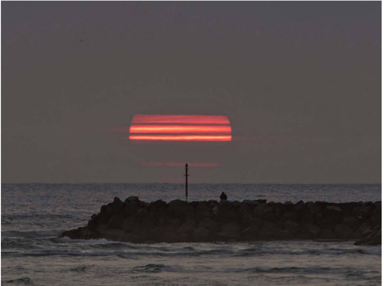
The sphere of the rising sun off the coast of New South Wales is only partially visible amid smoke from Australia's bush fires. (Bryan Ricketts)