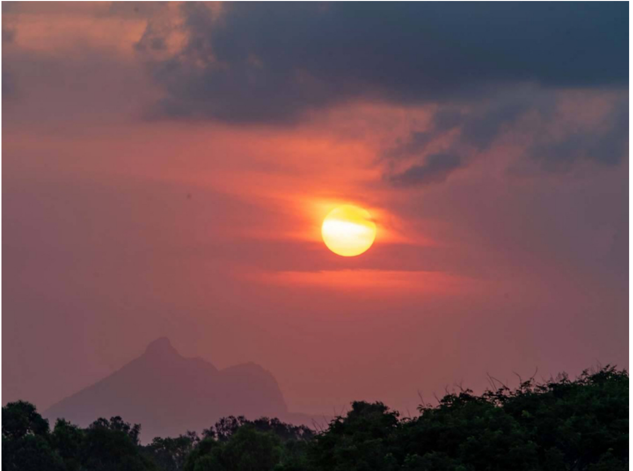
The setting sun is obscured by smoke from bush fires in New South Wales, Australia. (Bryan Ricketts)