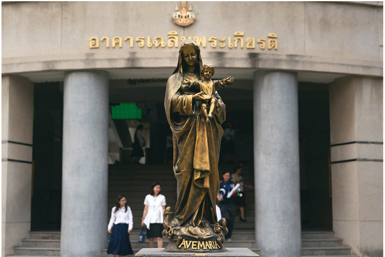
Teachers leave for the winter holiday past an Ave Maria statue at the entrance to the Mater Dei classrooms.