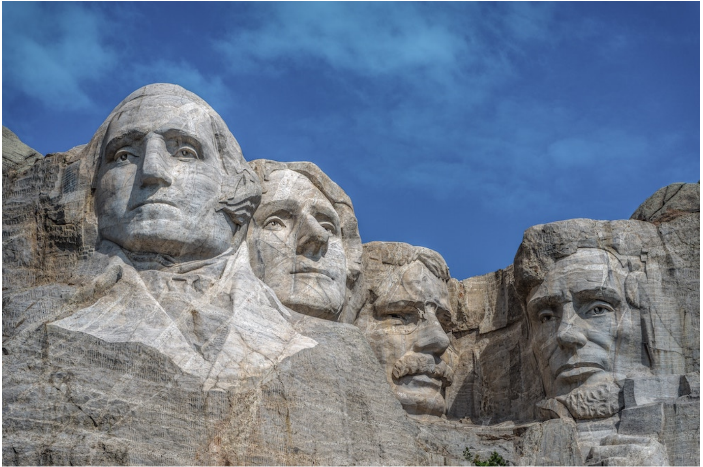
Mount Rushmore National Memorial, South Dakota