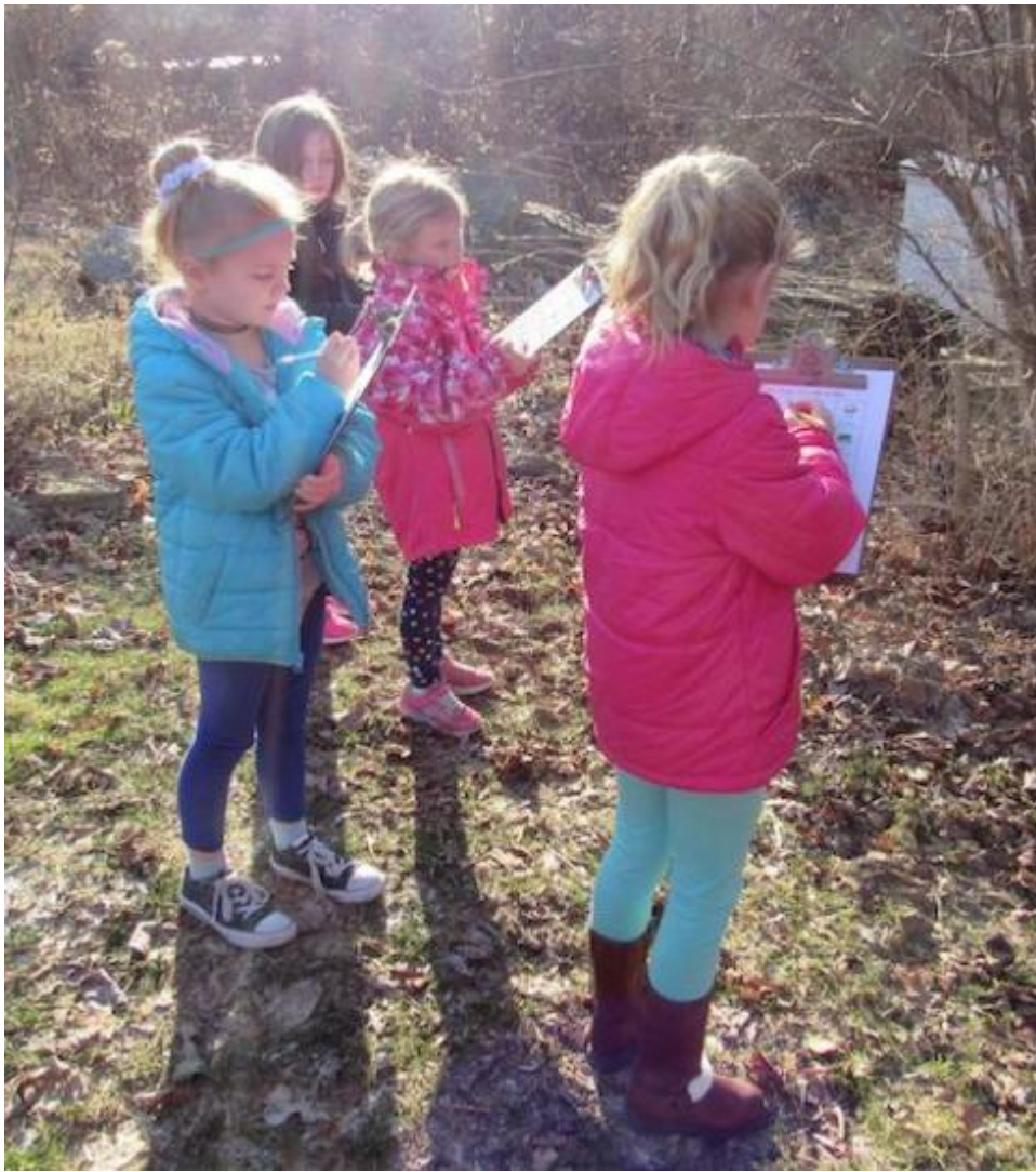
Girls Scouts outside the Sisters of Charity of Cincinnati's Earth Connection center take notes on nature.

Not far from Earth Connection, the entrance to the motherhouse property displays 46.5-kilowatt solar panels, which make a difference in Earth's atmosphere and in the utility costs of our large campus, providing electricity for two large apartment houses. In two years' time, this system saved enough electricity to run an electric car 820,913 miles, burn 101.78 barrels of oil and save 16.3 trees.