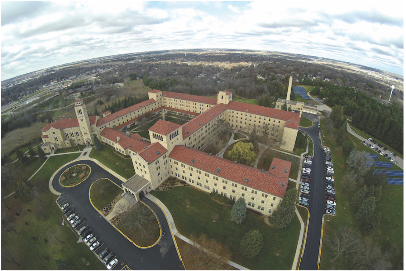
Aerial view of Franciscan Sisters of Rochester's motherhouse in 2018, showing solar panel field to the right of the property (Franciscan Sisters of Rochester, Minnesota)