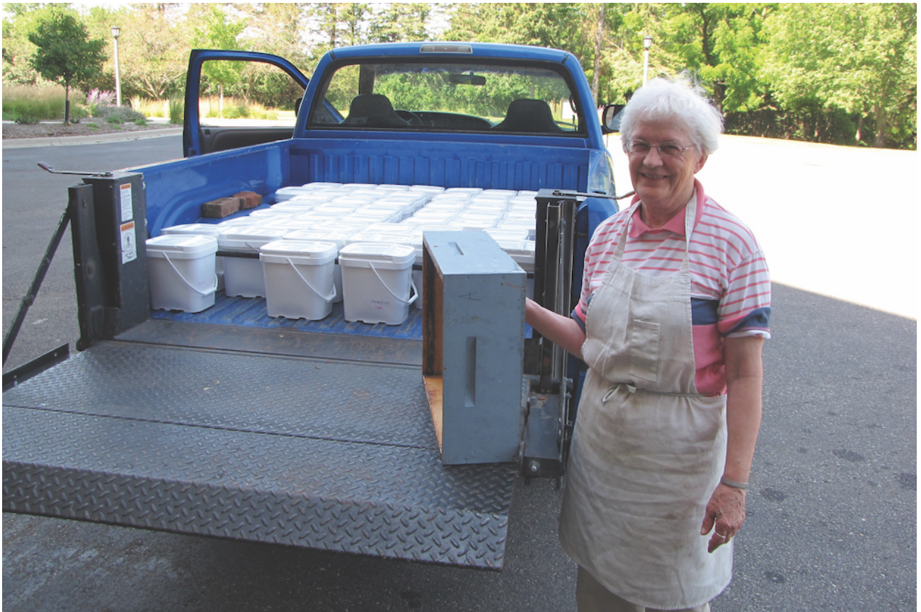
Beekeeper at the Franciscan Sisters of Rochester's motherhouse (Franciscan Sisters of Rochester, Minnesota)

Beehives became a permanent fixture at our motherhouse in 2000 and provide us with honey and wax. Our vegetable garden, flower beds, prairie grass plots and flowering bushes provide the bees with forage while beautifying the environment and removing carbon dioxide, and we educate people about the many dangers bees face today.