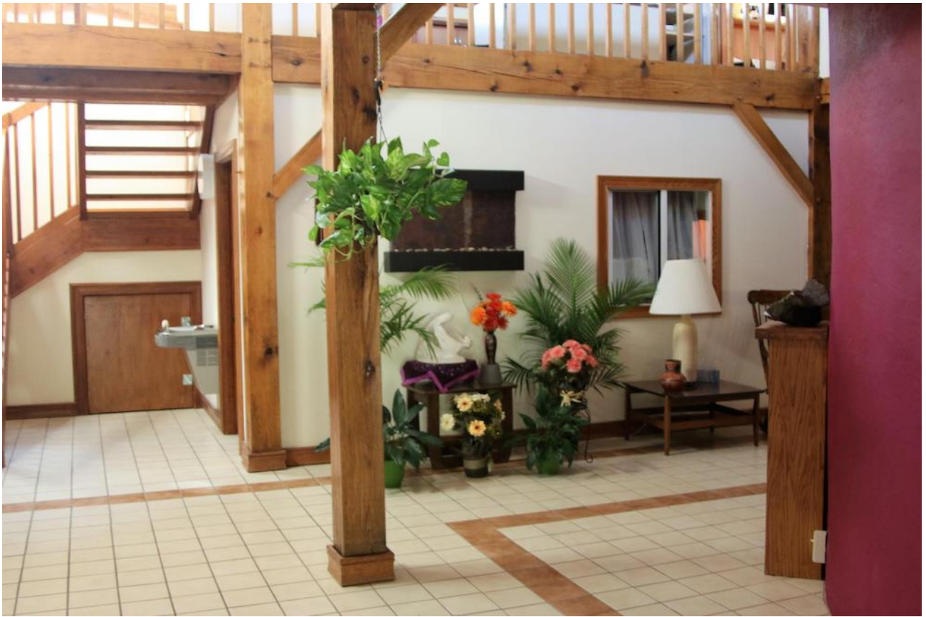
Earth Connection is a remodeled garage with reclaimed wood, furniture, carpeting and an entire wall of recycled aluminum cans and installing a photovoltaic solar panel heating system. (Sisters of Charity of Cincinnati)