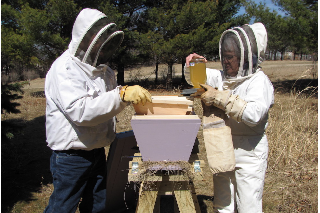
Beekeepers at the Franciscan Sisters of Rochester's motherhouse tend to the bees.