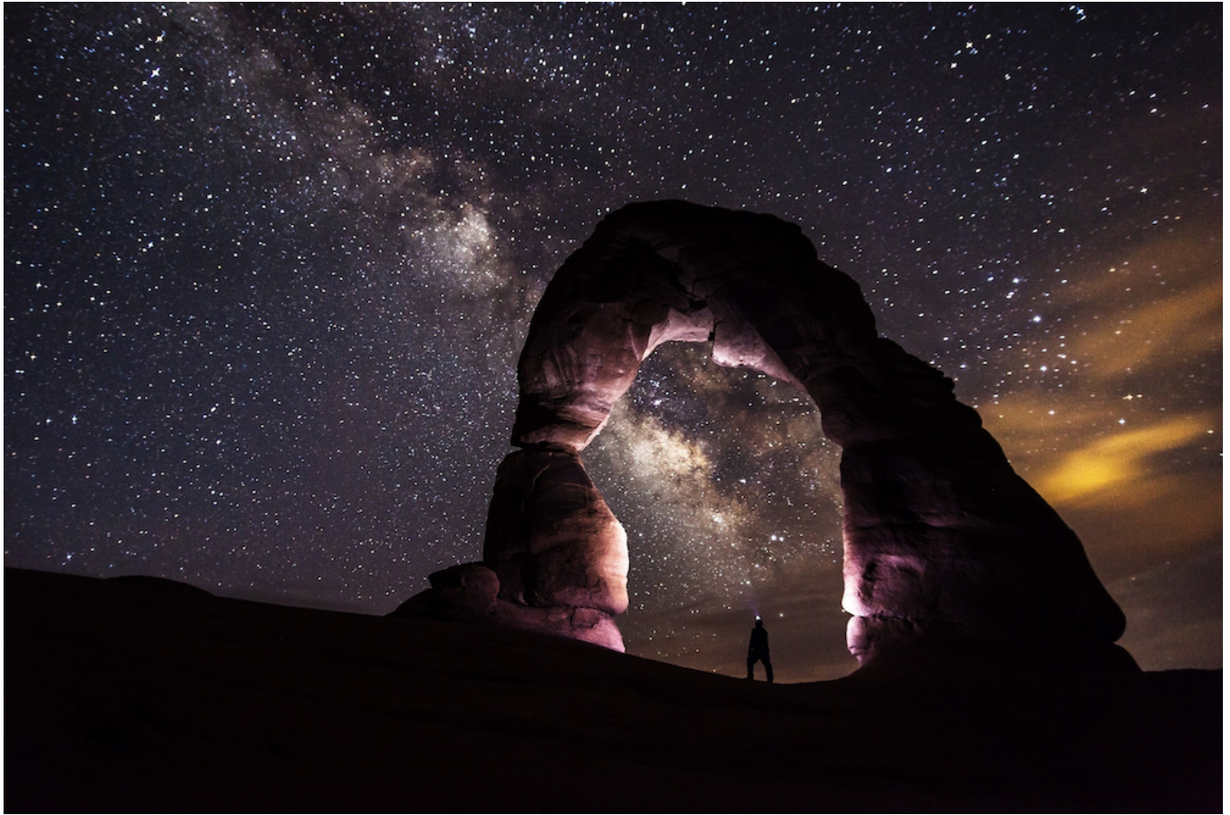
Delicate Arch, Arches National Park, Utah

The great deconstruction began for many of us years ago when studying and implementing in our houses and lifestyles a total respect for sister Earth by implementing "sustainability principles":