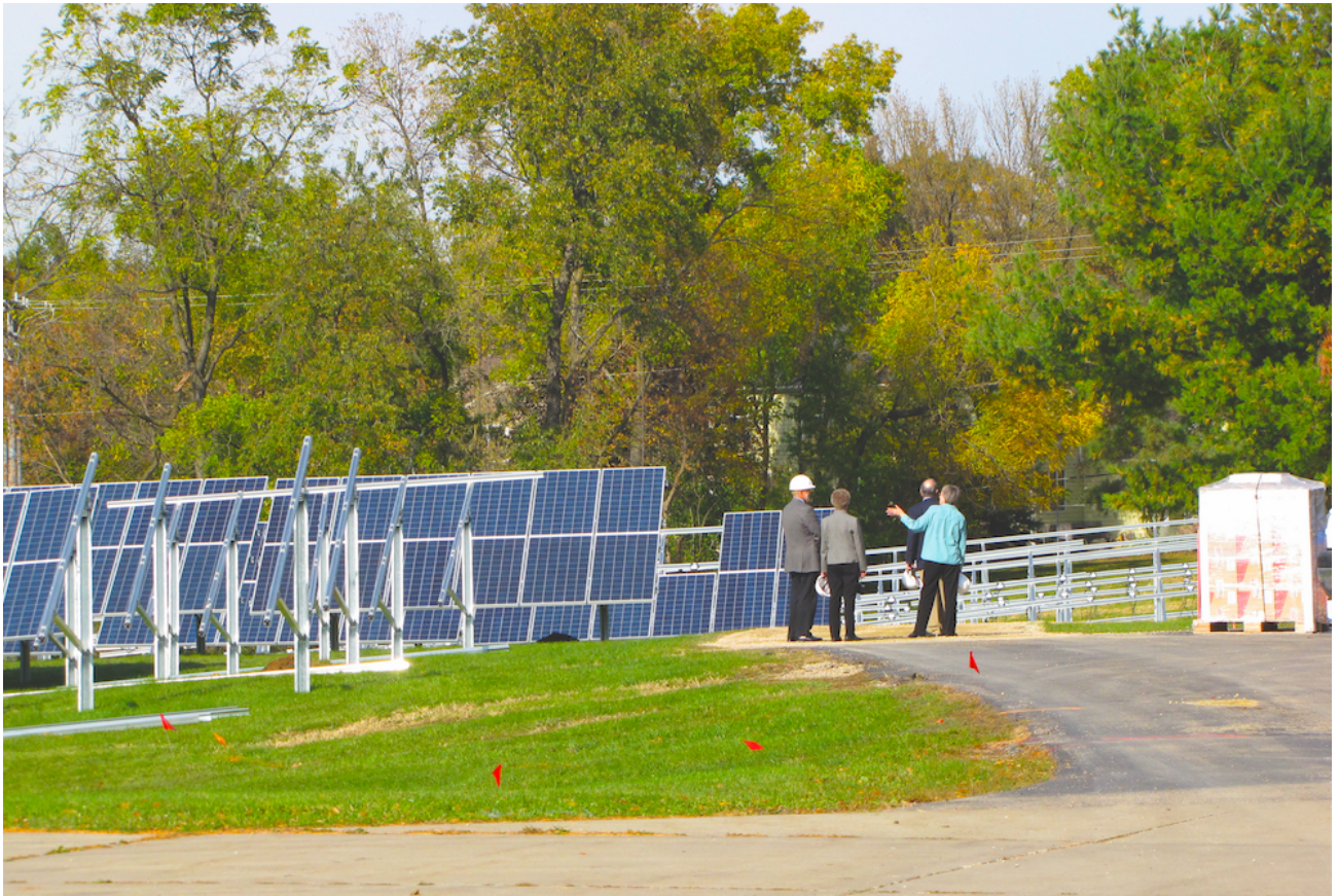
Touring the solar panel array in 2014, when they were about one year old on the property of the Franciscan Sisters of Rochester, Minnesota