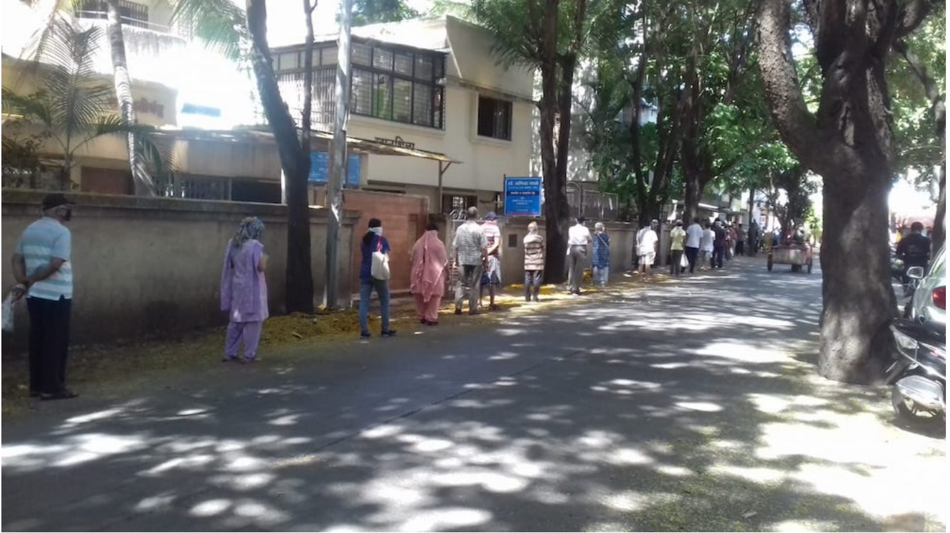
People practicing social distancing in India

Some of the 10 sisters shared their experience with me: A common experience was that they were shocked and disturbed by the quick progression of the disease, which left no time to adjust to the reality. A close friend who had a hard time coping with the first sister's death said it was both "sad and unbelievable to me since it all happened so fast." Though the sisters are finding different ways to care for and support each other, they felt vulnerable and frightened. The virus was no longer "out there" but in their home.