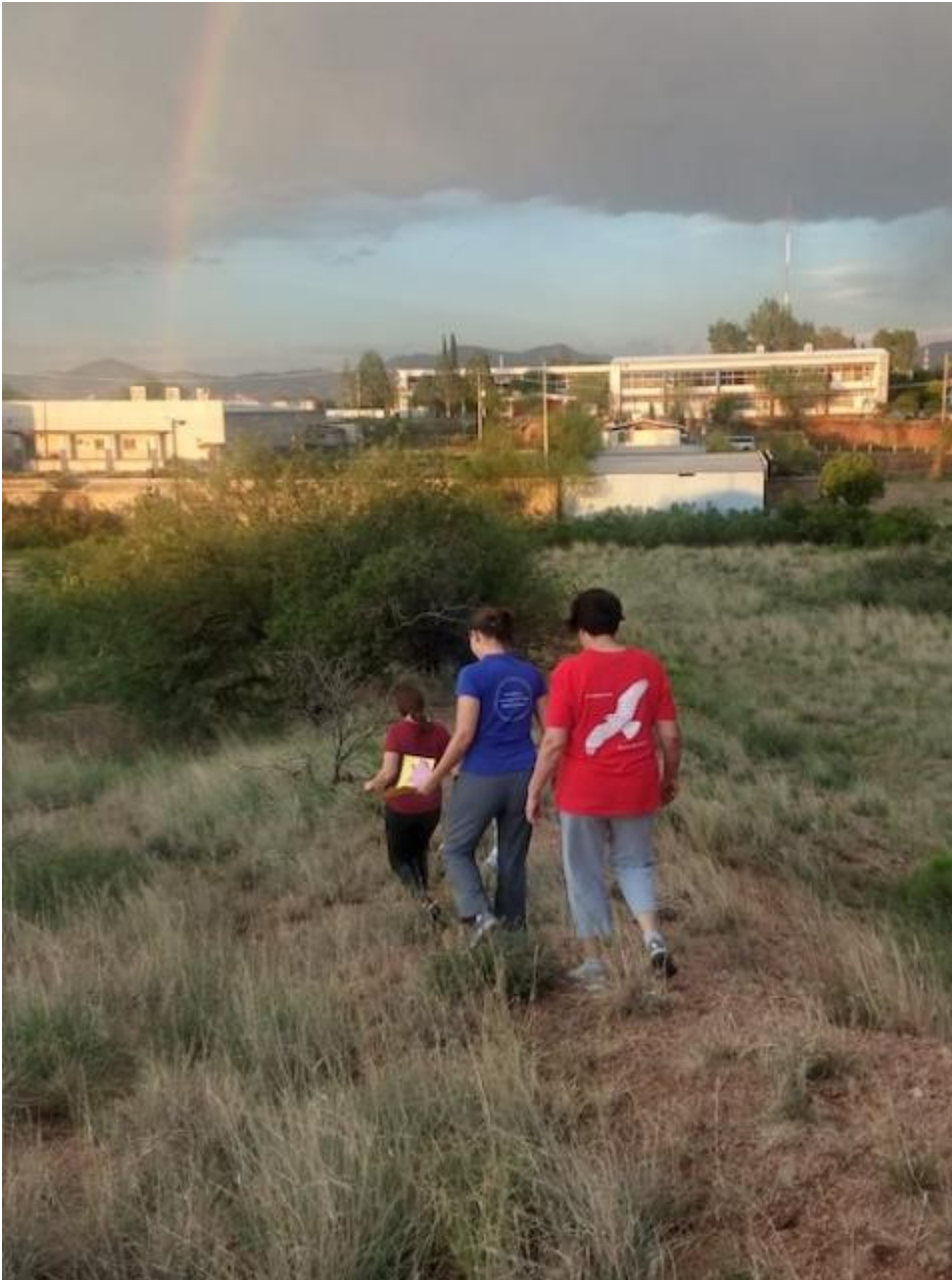
The running path near the house in Nogales, Sonora, Mexico (Tracey Horan)

hill from the cemetery near our house to the Kino Border Initiative (KBI) migrant center to get breakfast. For that short stretch, we share a sacred path.