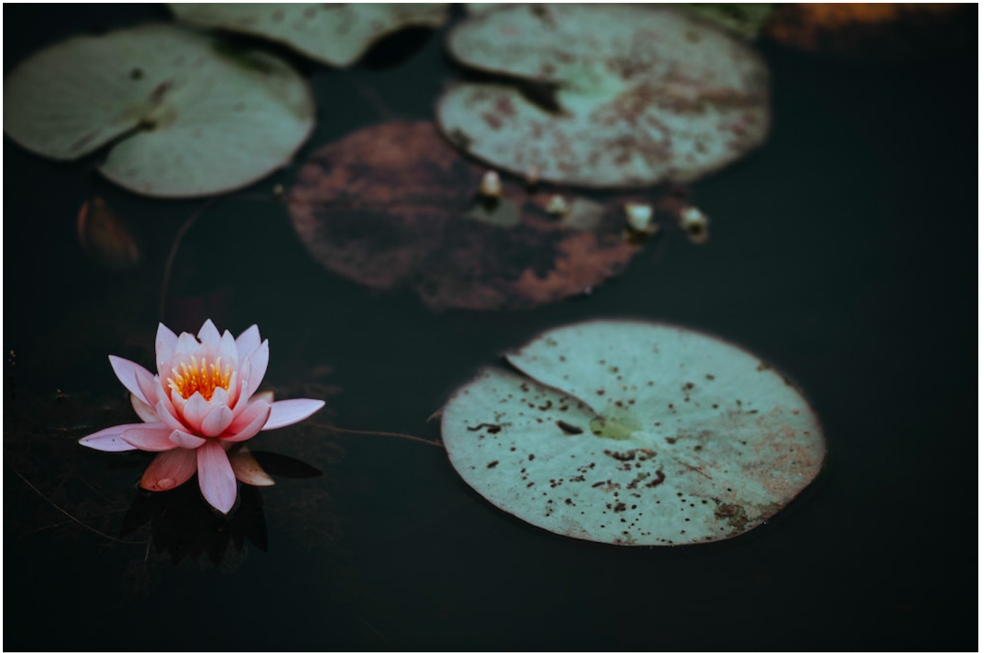
Lotus flower