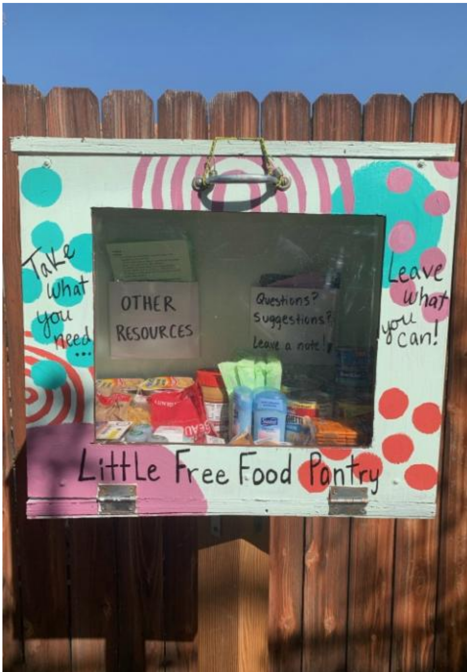
The Little Free Pantry in front of the Denver Loretto Volunteer House

When I made my way to a back-and-away corner of the yard, I found the dilapidated skeleton of what used to be a Little Free Library . Unfinished, filled with leaves and with a dysfunctional latch, my next project rested atop its rickety post and tiredly leaned against the fence.