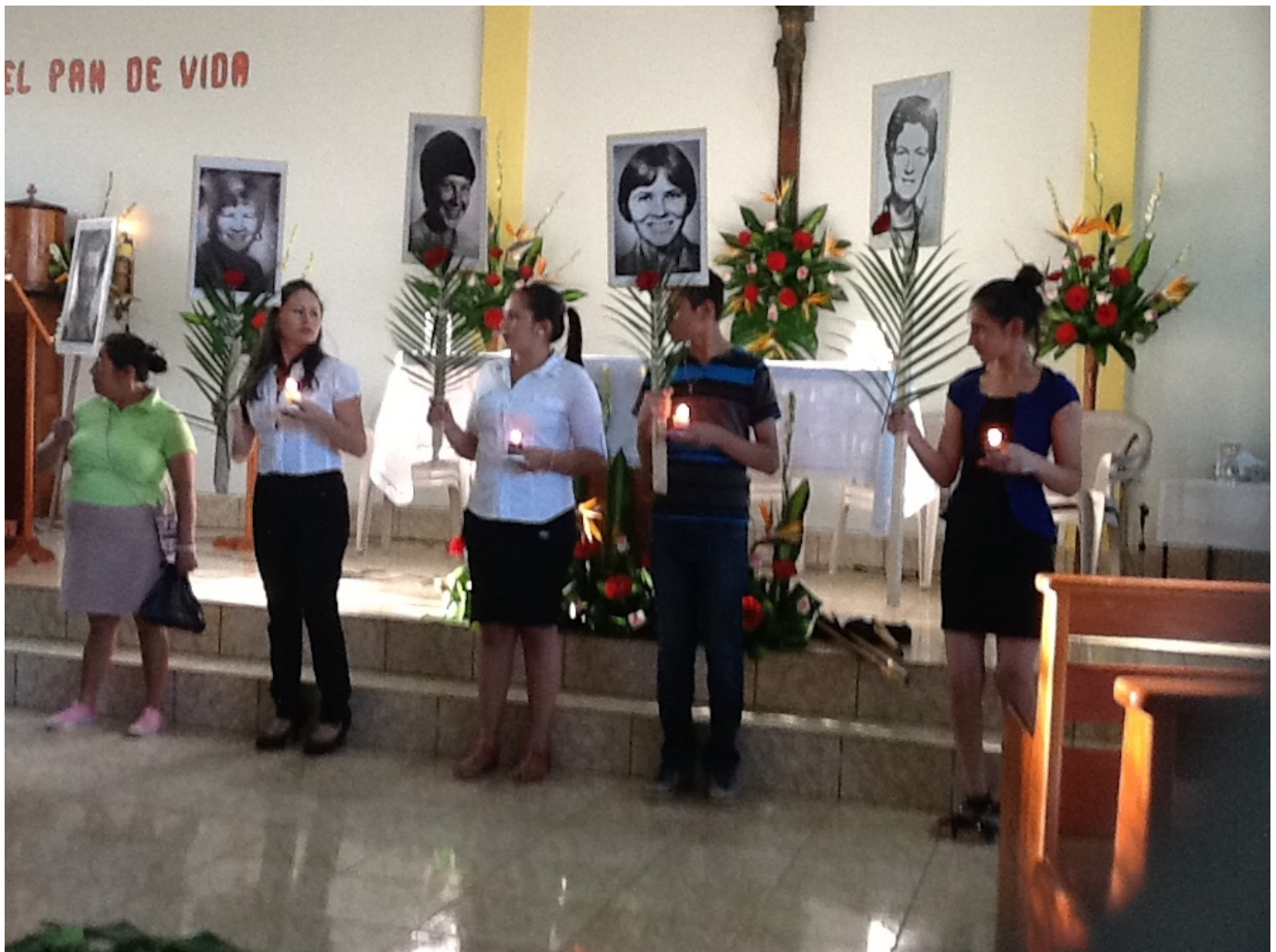
Prayer service in El Salvador village church in 2015 in honor of lay missionary Jean Donovan, Ursuline Sr. Dorothy Kazel, and Maryknoll Srs. Ita Ford and Maura Clarke

So, it's difficult to say what observing this kind of fast means. It's difficult to say where this kind of fast might take us. But the Gospels tell us that now that the bridegroom is no longer with us in body, we can fast. So I suppose that is our role now — to enter deeply into this fast and to understand its dangers and to believe with all our might that no matter where this fast takes us, God will say to us, "Here I am."