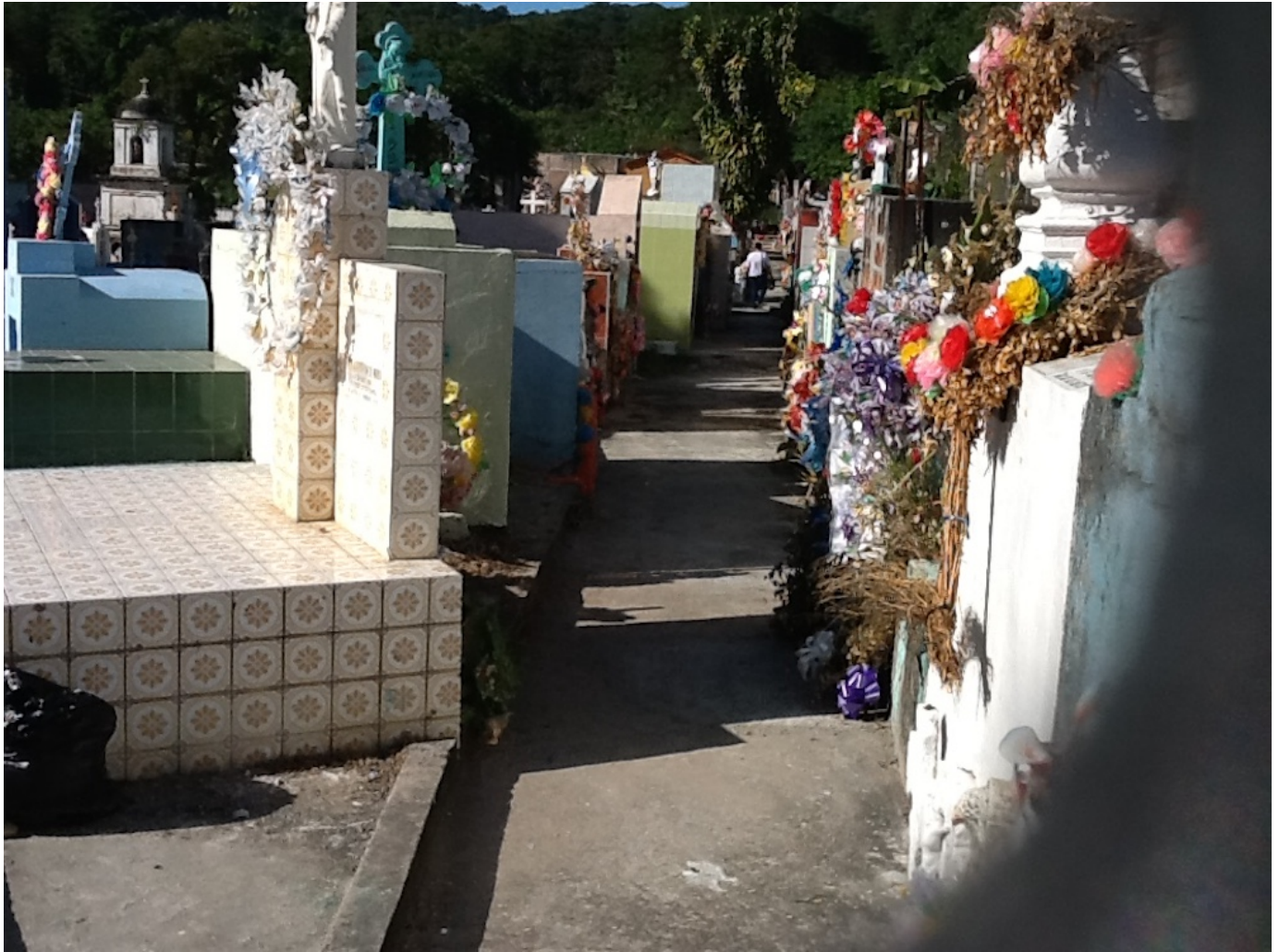
Cemetery where Maryknoll Srs. Ita Ford and Maura Clarke are buried in El Salvador, pictured in 2015