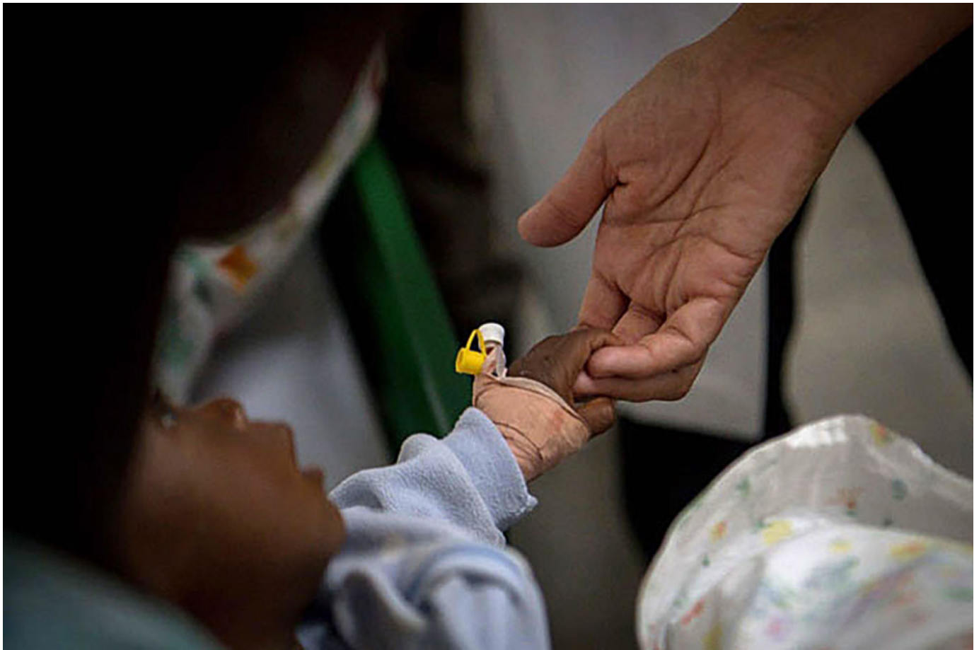
An Ursuline sister holds the hand of an infant patient in a cholera clinic in Verrettes, Haiti, in 2017.

Generally speaking, the diaconal works of women religious (medical clinics, food banks, educational initiatives) are largely self-funded. Hence, the UISG request strikes to the heart of the diaconal vocation and office in the church. It underscores the need for bishops and parishes to provide for the poor with diocesan resources, not replacing the many organizational works of women religious, but complementing them.