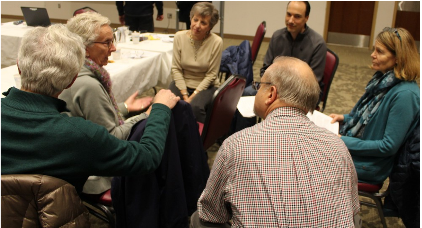
Parishioners from St. Rose of Lima Parish and members of Congregation B'Nai Jeshuran of Short Hills participate in a discussion group.

out those images are unfair, patronizing and just not true. It was important to me that they understood the work and power of women religious and what we have been able to accomplish throughout the centuries.