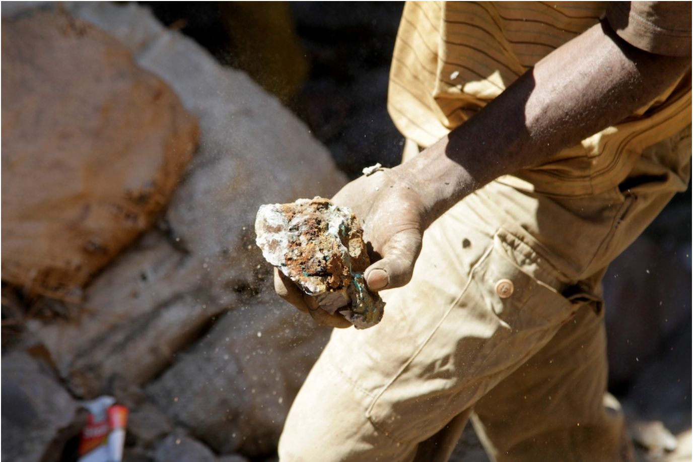
An artisanal miner carries raw ore near Kolwezi, Democratic Republic of Congo, Aug. 16, 2016.

"It has helped more than 3,000 children quit the mines and attend school, 500 families to secure alternative and sustainable livelihoods, 300 girls and women to gain new skills and make a decent living away from the mines, and educated more than 20,000 people on how to campaign for better working conditions," the congregation said.