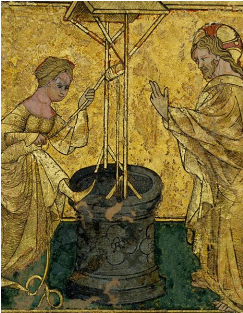
"Jesus and the Samaritan Woman at the Well," detail, circa 1420 (Metropolitan Museum of Art)

What began with a simple request led to a liturgical discussion between a theologian in the making and the Source of theology. Their dialogue led to a whole town encountering Jesus.