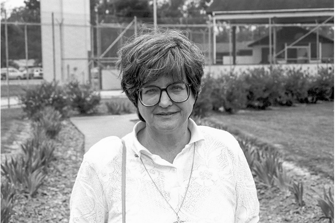
Sr. Helen Prejean outside of Angola State Penitentiary in Louisiana in 1999

"I just got lucky and met two popes," Prejean said. "I'm just trying to do my best with what I know."