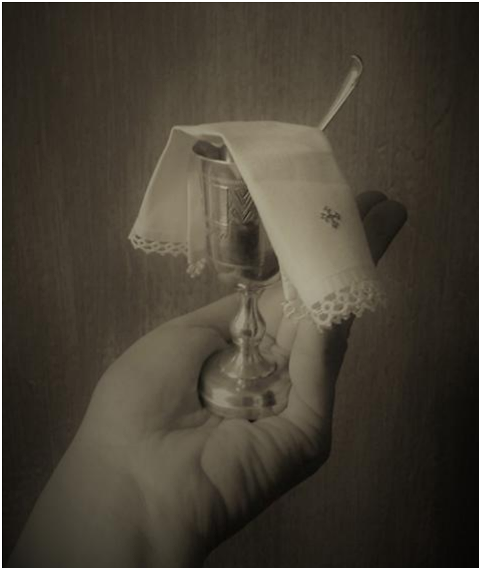
A miniature chalice from the time of the underground Ukrainian Greek Catholic Church

The Basilian Sisters came to Croatia from Ukraine in 1915. In the late 19th and early 20th centuries, thousands of Ukrainians left their homeland in search of a better life. Thanks to Metropolitan Andrey Sheptytsky , priests and nuns followed the exodus to support their people, and the community of Basilian Sisters in Croatia developed and grew.