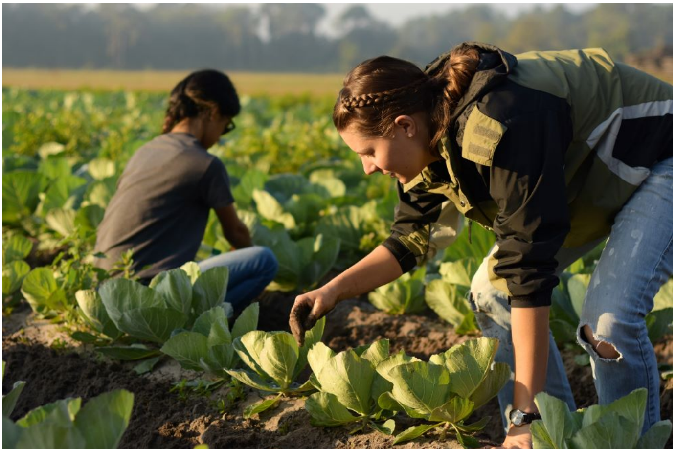
Service-learning students pick cabbages in a farm in Zellwood, Florida, in 2015, part of Hope CommUnity Center's program for students to gain a better understanding of

Farm work is hard, back-breaking work. Farmworkers are essential workers but often do not get the respect they deserve. In the afternoons, we unpack the students' experience and teach as community members tell their story. It is powerful. Lives and attitudes change. People from very different worlds come together and become family. We learn by serving, and we better understand our service by engaging directly with the community. Powerful, sacred moments are part of the total experience. We stay in touch, and the students become advocates for change.