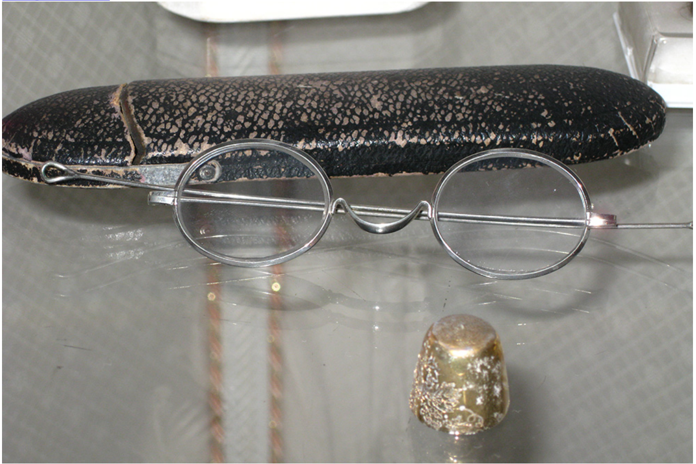
Photo of Blessed Clelia Merloni's reading glasses on display in her bedroom in the Generalate of the Apostles of the Sacred Heart of Jesus in Rome, Italy.