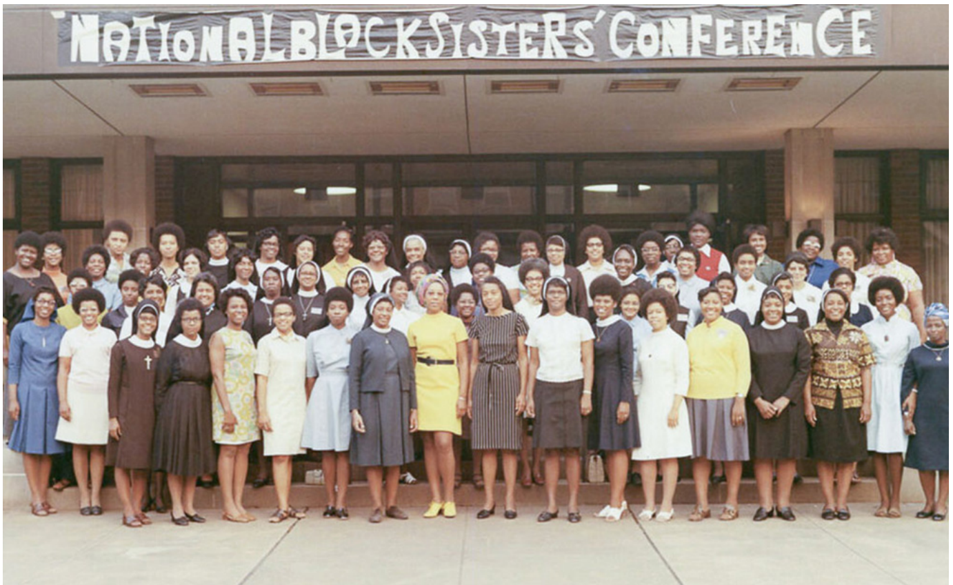
Early members of the National Black Sisters' Conference outside the conference headquarters in Pittsburgh in the early 1970s.