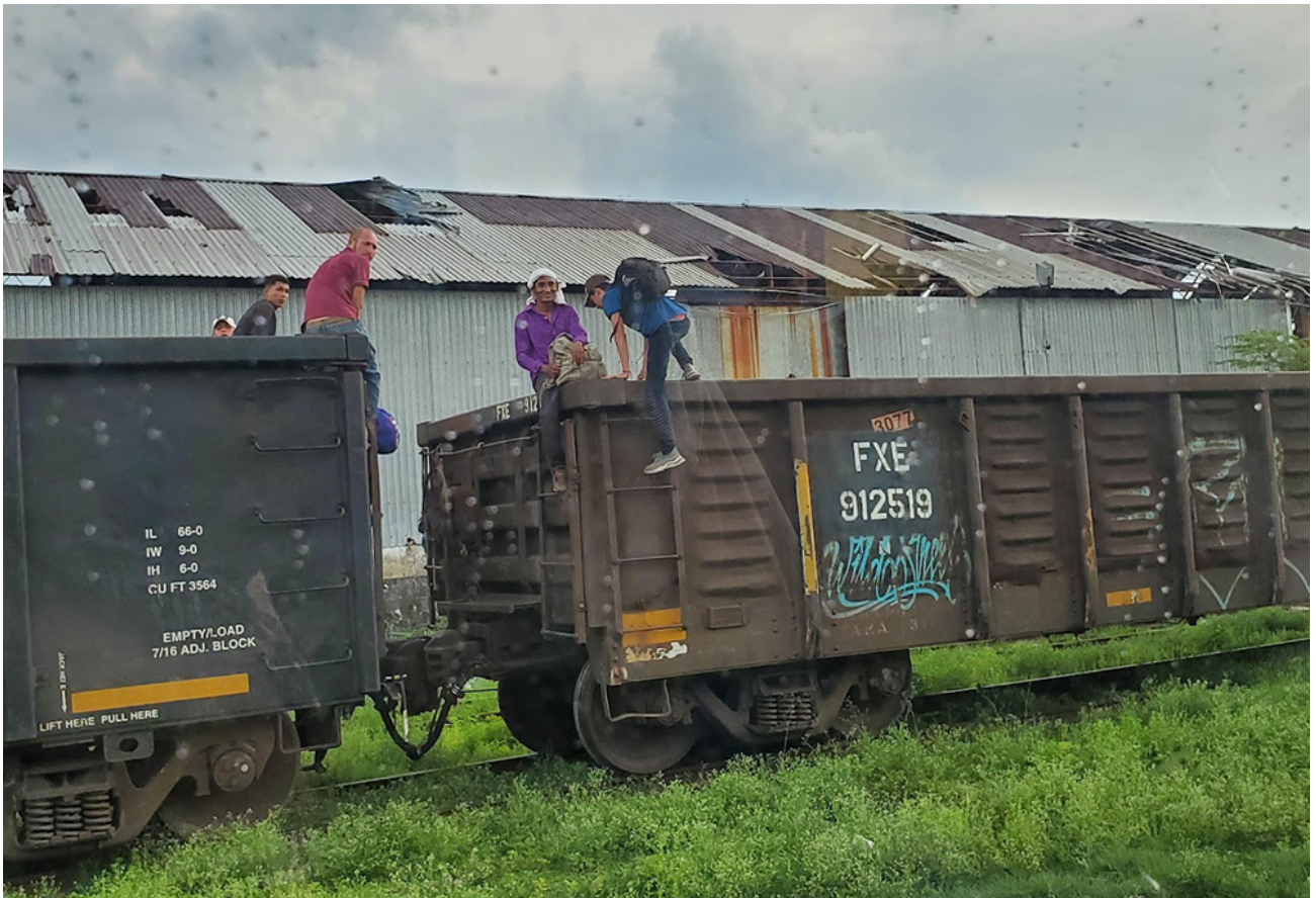
Migrants hop on a train at Coatzacoalcas, Mexico.