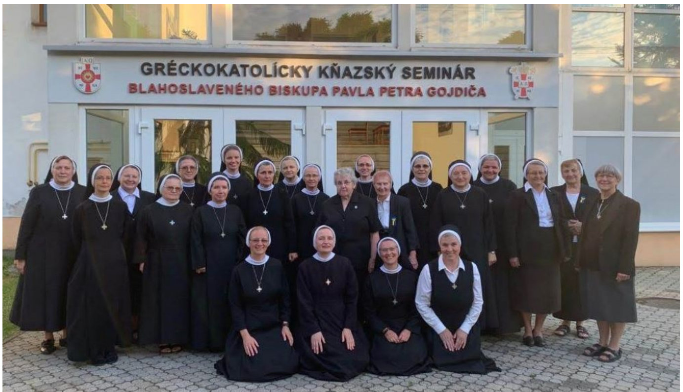
The Council of the Basilian Sisters meets in August 2022 in Preshov, Slovakia.

It is important for us to help the sisters, the people they cared for, but above all, to be there, expressing our closeness and emotional support. On that day, I felt how much my presence among the sisters in Ukraine meant to them. I visited Ukraine for the second time in July to celebrate the perpetual vows of four Basilian Sisters. At that time, the initial fear and confusion in the society had been replaced by endurance and a determined willingness to work long-term for victory.