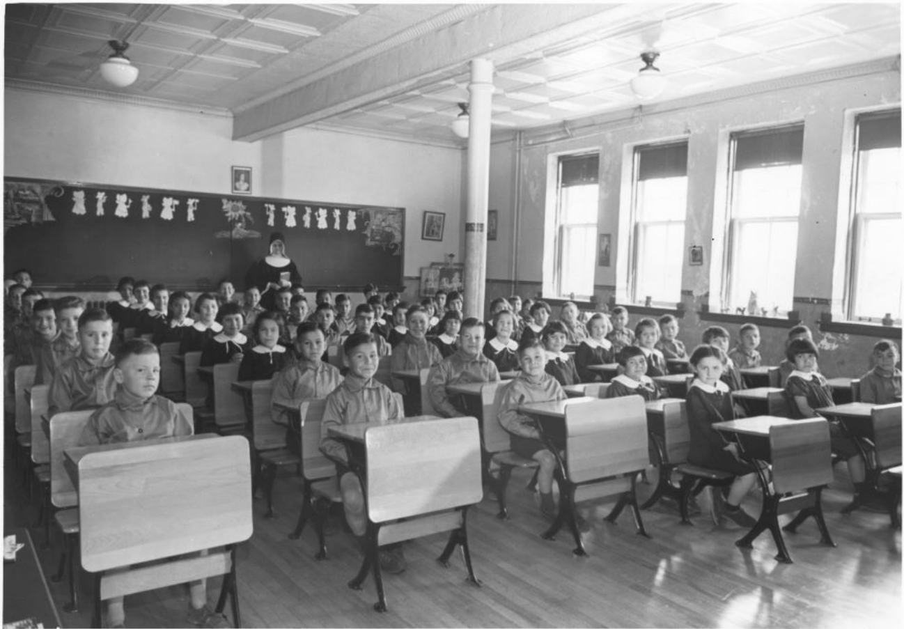
A nun stands at the back of a classroom at the Shubenacadie Residential School in this 1930s photo. The school operated 1929 to 1967.