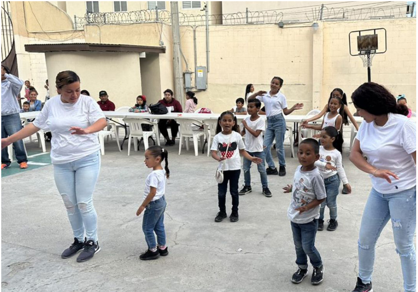
Kids dance during a fun activity at Casa Eudes in Tijuana, Mexico.

In 2021, Good Shepherd responded to cross-border migration in Tijuana, Mexico, setting up Casa Eudes , a community center that supports women and children and helps families rebuild their lives.