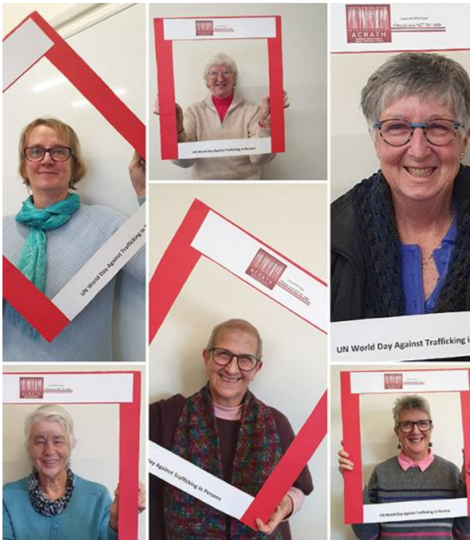
Victorian members of Australian Catholic Religious Against Trafficking in Humans, showing their support for the U.N. World Day Against Trafficking in Persons in 2021

In Australia, Good Shepherd Sisters don't work directly with people who are trafficked; we are members of Australian Catholic Religious Against Trafficking in Humans, or ACRATH , which assists in education, advocacy and support and works with other NGOs and state and federal governments to address the issue. Recently, advocacy over 17 years bore fruit for a group of workers from Vanuatu who received wages that had been kept from them. In May 2023, the Australian government allocated funds so victims and survivors of human trafficking can access support without involving law enforcement. A momentous achievement! This gives families safety and protects their immigration status. Their stories have informed advocacy