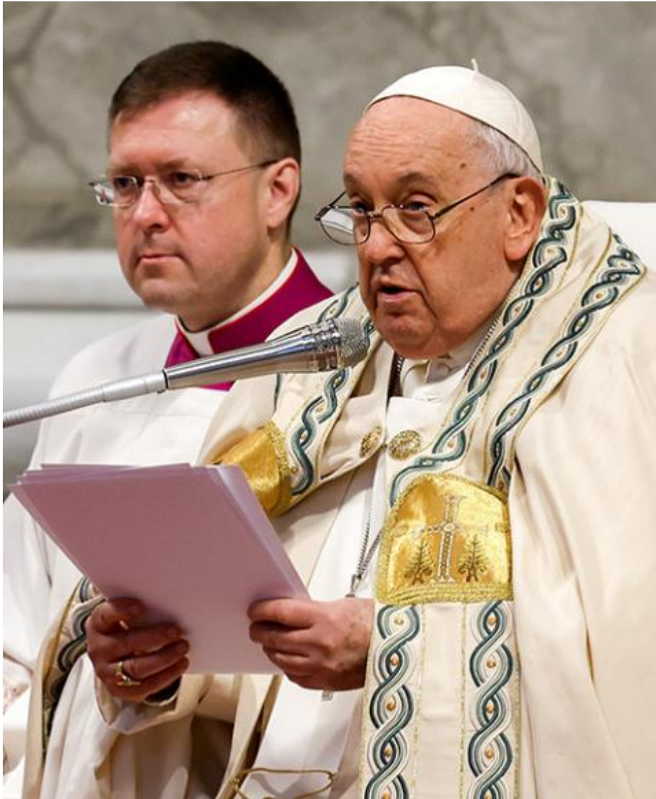
Pope Francis gives his homily during Mass for the feast of Mary, Mother of God, and World Peace Day in St. Peter's Basilica at the Vatican Jan. 1.

This year's theme focused on artificial intelligence and peace. Pope Francis, in a message , said, "The remarkable advances in new information technologies, particularly in the digital sphere, thus offer exciting opportunities and grave risks, with serious implications for the pursuit of justice and harmony among peoples."