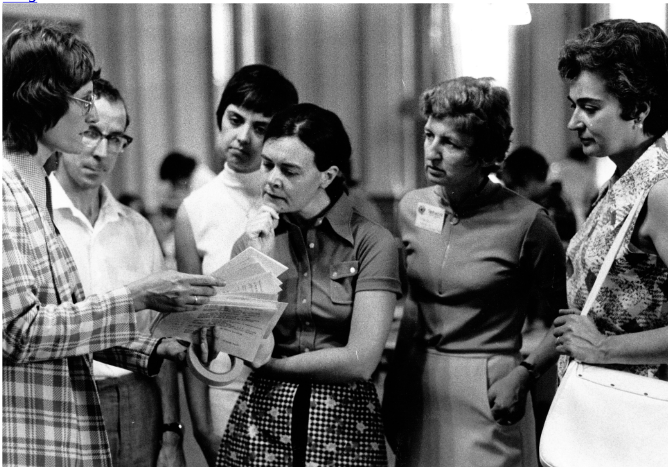
Delegates at a 1974 Network legislative seminar