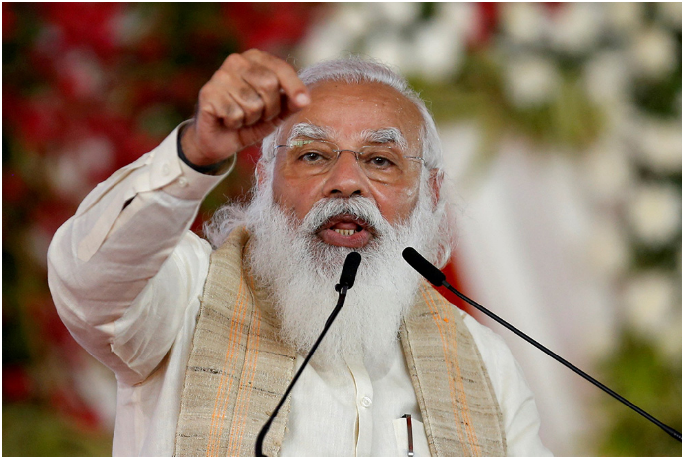
Indian Prime Minister Narendra Modi is pictured in a March 12, 2021, photo.

The anti-conversion laws implemented by the current regime exacerbate the marginalization and diminishing status of Christians. This religious group, along with Muslims, has been subjected to targeted hatred, mob lynching, and segregation due to policies directly affecting minority communities.