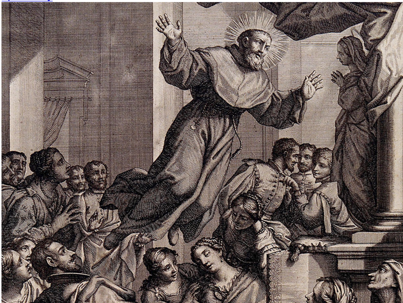
St. Joseph of Cupertino is depicted levitating in an 18th-century engraving by G.A. Lorenzini.