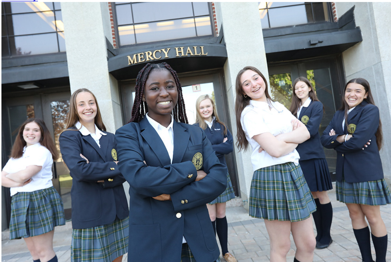
Students at St. Mary Academy - Bay View in East Providence, Rhode Island