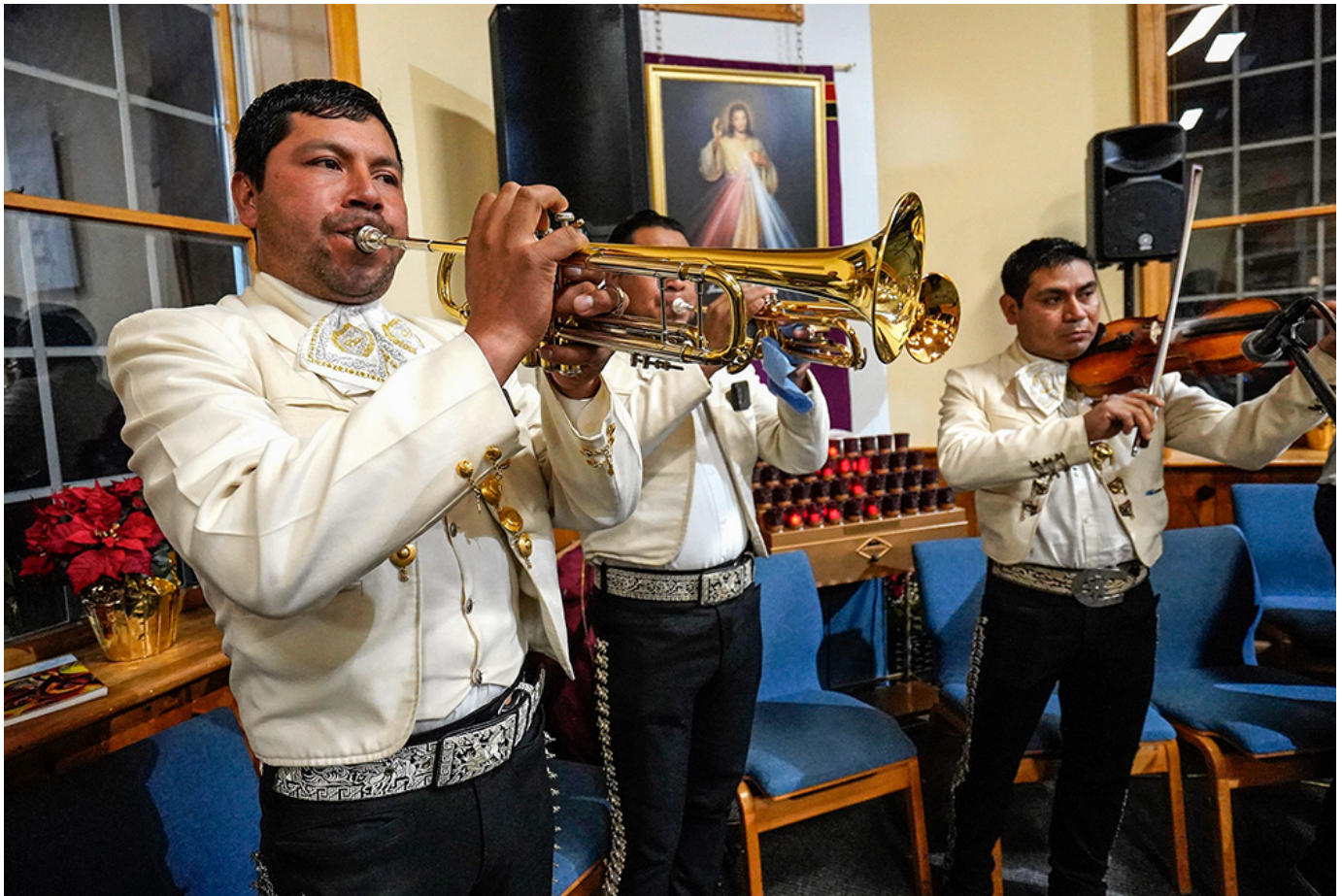
A mariachi band plays music during a Spanish-language Mass marking the feast of Our Lady of Guadalupe at Resurrection Church in Farmingville, New York, Dec. 12, 2021.

So, the concern of this book is about faith translation as well, and how we need to dialogue with music and culture.