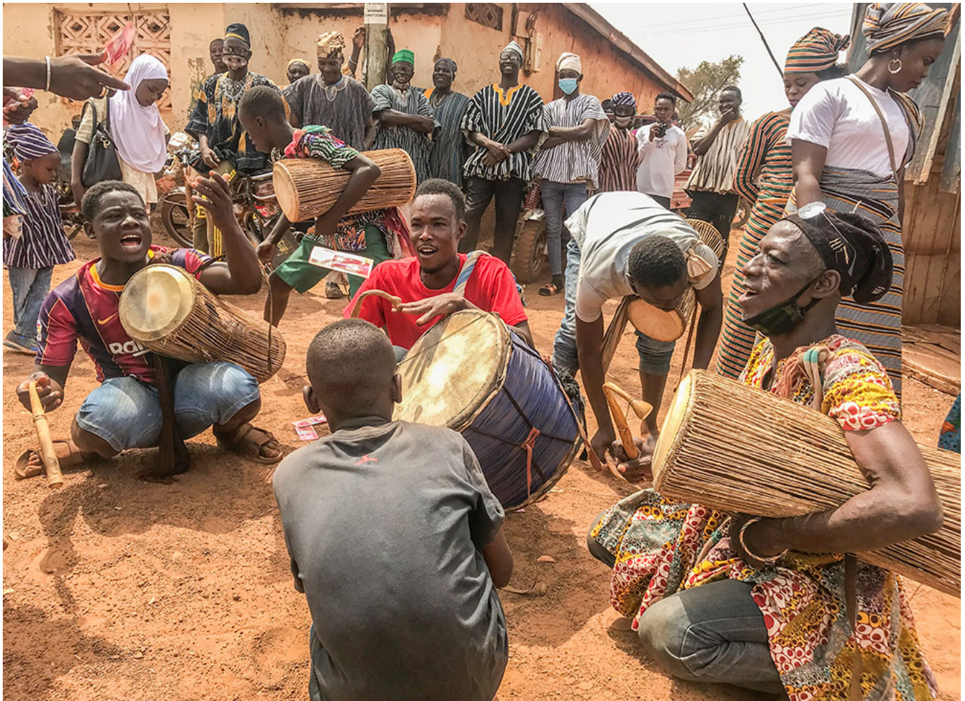
A group of local drummers and dancers from Vitting village in Tamale, Ghana

We're being invited to be aware of the different levels of our sense of things. So, our psyche isn't just theory or organization, it's also relationality, connectivity, imagination, culture, interaction, men and women, different cultures. All of that is messy, but it's rich.