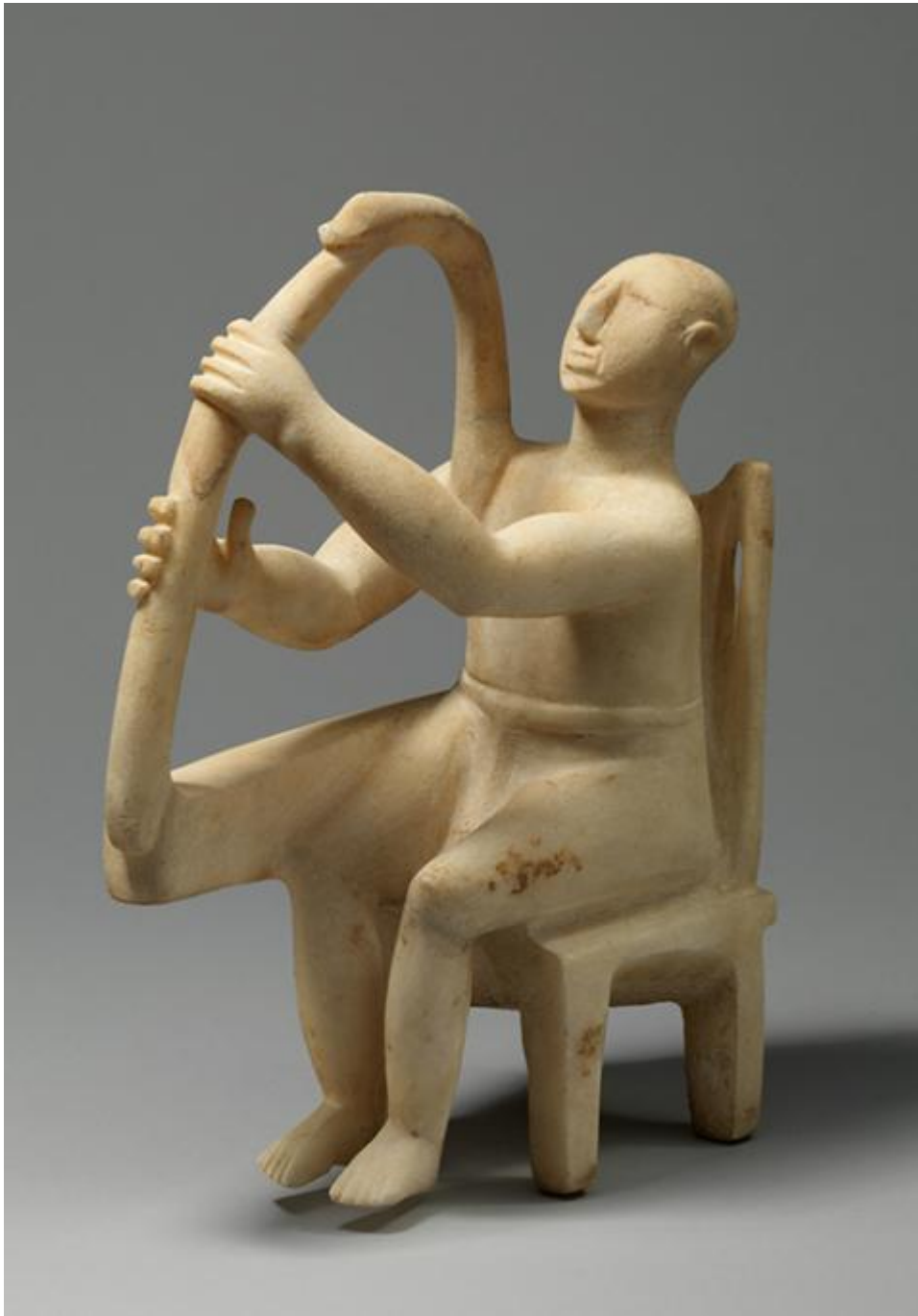
Marble seated harp figure, Cycladic culture, 2800-2700 B.C. (Metropolitan Museum of Art)

arts both can be prophetic and are being prophetic. So, people are coming in sideways and saying, "No, we need to stretch things." That's part of what I'm trying to do.