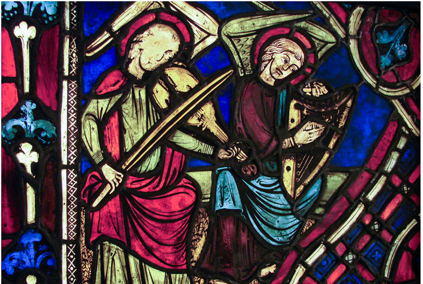
Angels play music in medieval stained glass at the Musée de Cluny in Paris.

Our understanding, our comprehension of reality, is our whole embodied self, made of mind, feelings and imagination.