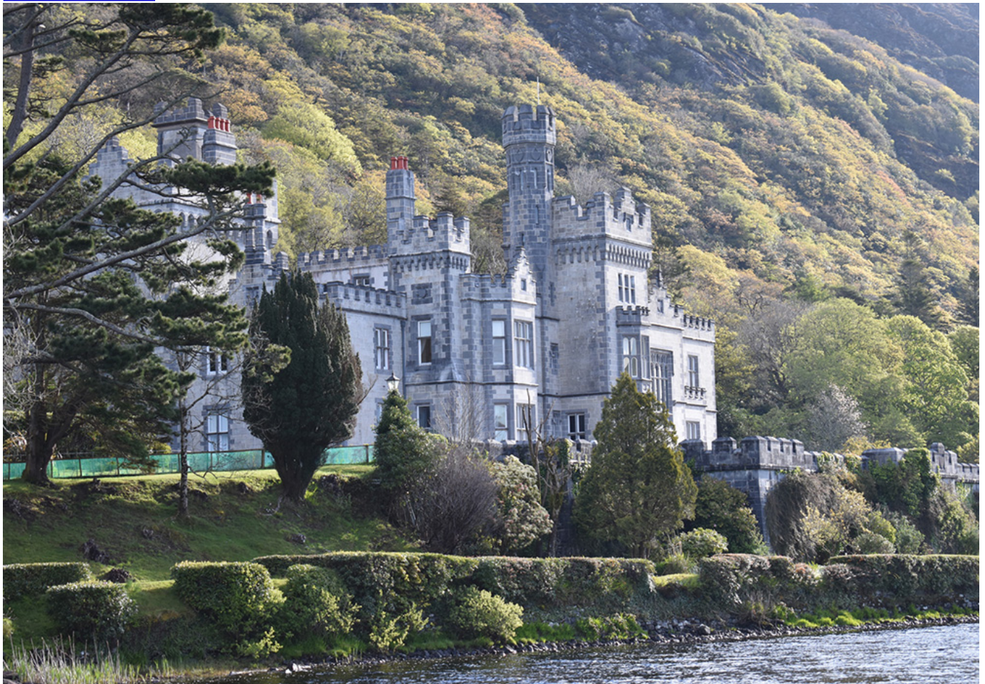
Kylemore Abbey in Connemara, Ireland