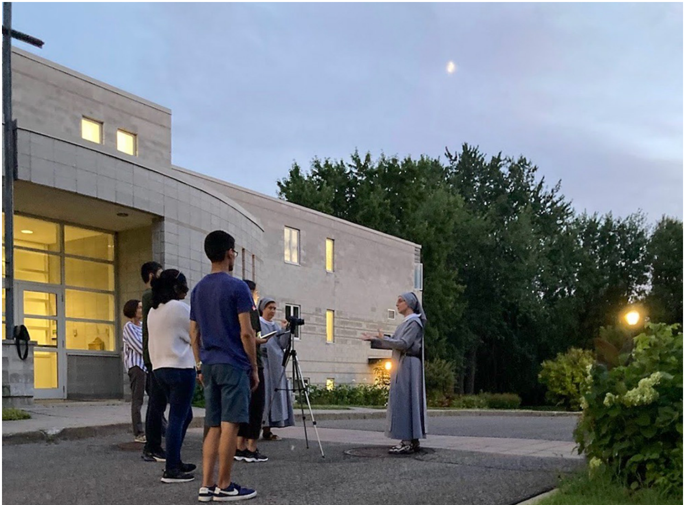
Nighttime filming of the documentary series "The Hidden Good in the City" in front of the Recluse Sisters' monastery in Montreal

The videos can be presented in parishes and groups, which can help to open up a dialogue with the younger generation on the existence and meaning of religious life. The videos can also be used to promote vocational pastoral care.