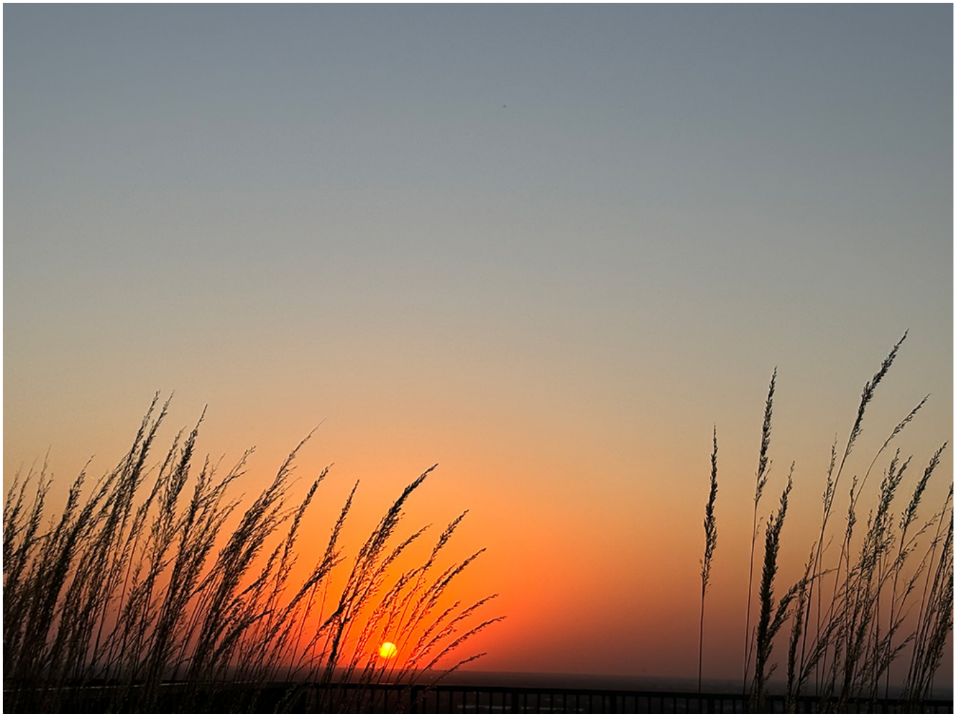
Sun sets over Chicago's autumn skyline, Oct. 5, 2024, as fall days grow shorter. (Ellen Dauwer)

Religious life is in Advent days, replete with diminished daylight and the stark outlines of bare deciduous trees. Many of our congregations no longer have fields overflowing with produce to consume and share. Yet, in the cycle of life and the pascal mystery, we are promised new life in abundance, born from and nourished by the humus of seasons past. It is somewhere between the days of harvest and those of new life.