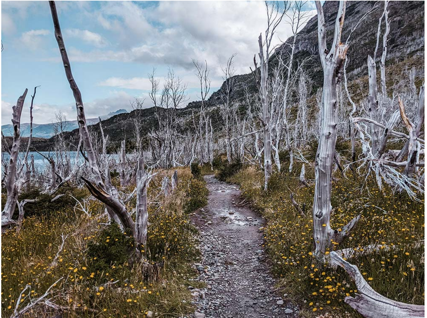
Torres del Paine National Park, Chile

Advent insists that there is a freshness, a newness on the way. The Divine Presence is rising up from within us and from within all creation. The Divine Presence is summoning us forward from the future, making a way in the wilderness of our messy world and our messy lives, where no path forward is yet visible.