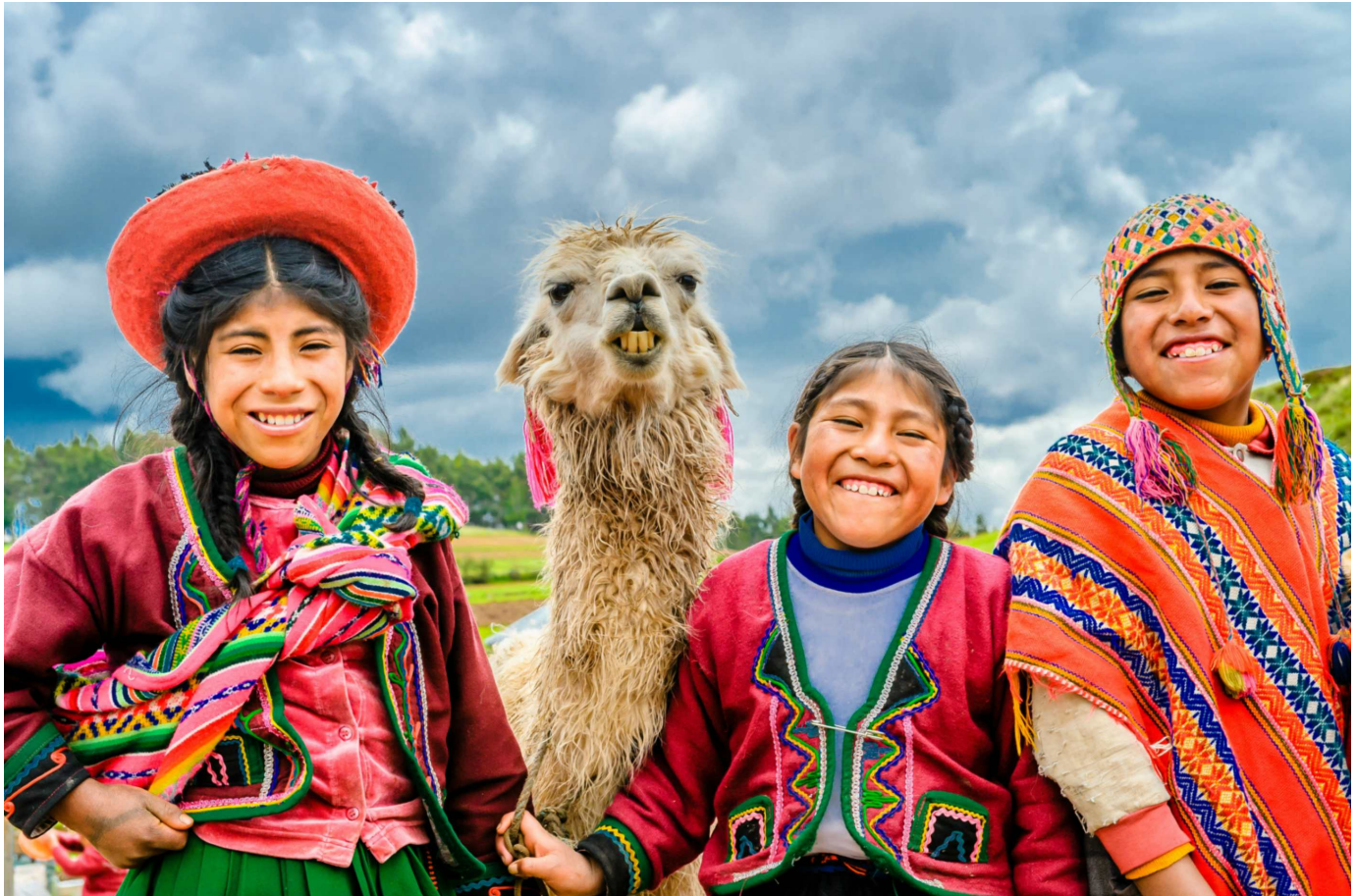
Group of children in Cusco, Peru