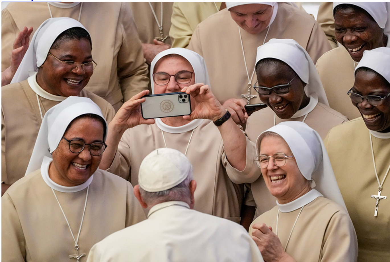
Pope Francis meets a group of nuns during his weekly general audience in the Pope Paul VI Hall at the Vatican, on Aug. 30, 2023.

Opinion Guest Voices Blog Social Justice