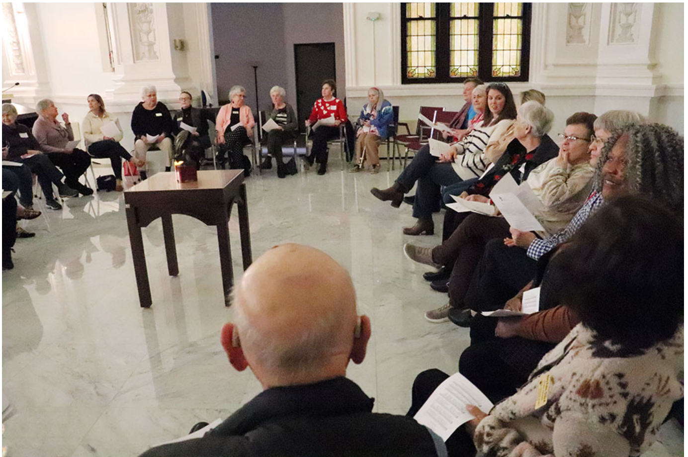
Associates of the Ursuline Sisters of Louisville meet at an associates meeting in February 2024.