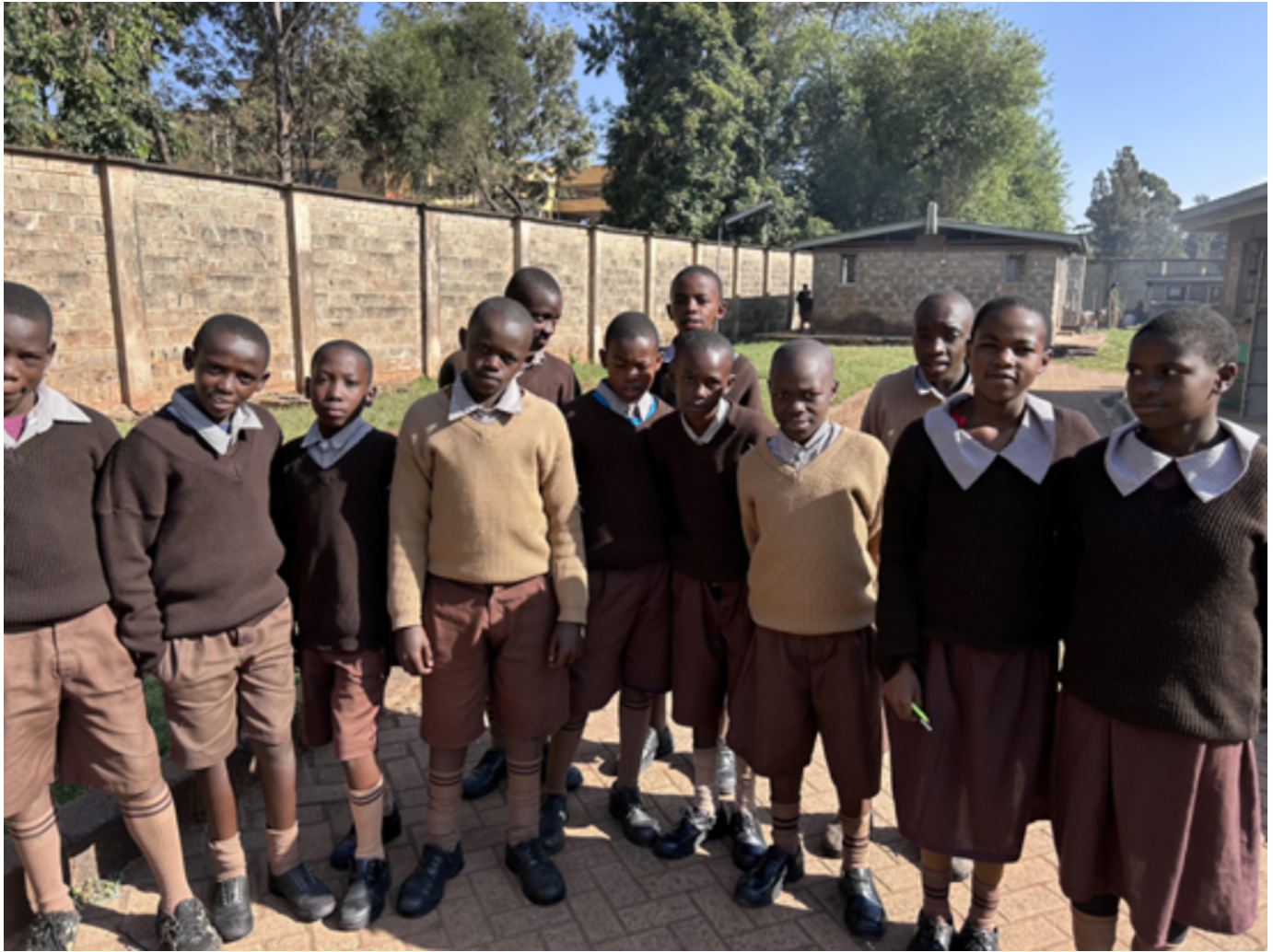
Students at the Amani School pose for a group photo.