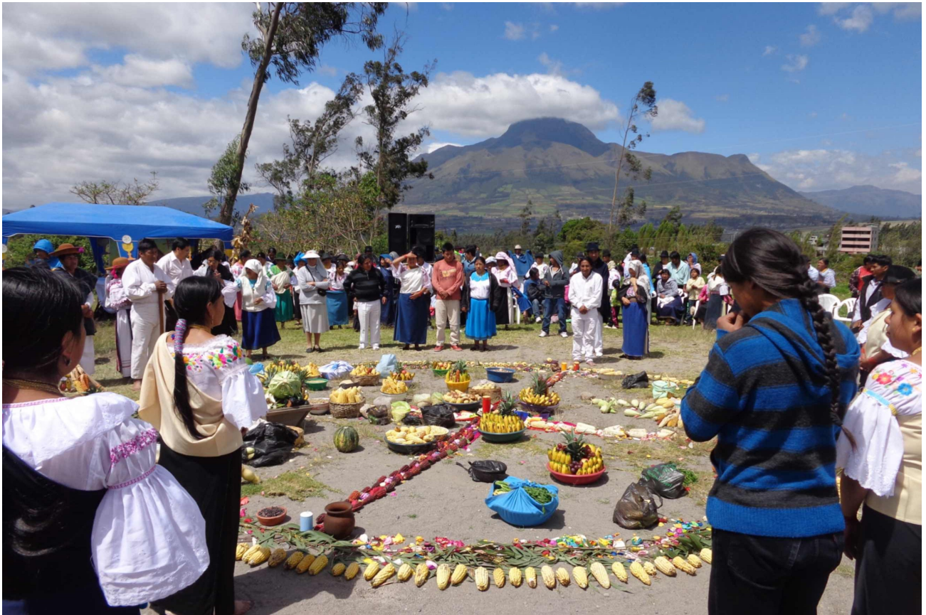
An inculturated celebration in a sacred pastoral place brings the community together around the four elements, symbolizing the union of peoples from different regions.