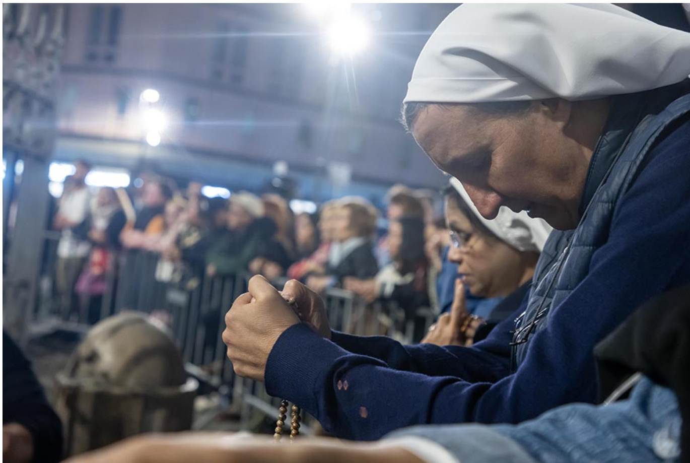
People gather to pray the rosary for the repose of the soul of Pope Francis April 24, 2025, at Rome's Basilica of St. Mary Major.

The days of Lent — 40 days and six Sundays — are a good opportunity and a wake-up call for me to slow down. I try to listen to my own restlessness and find my rest in God, becoming revitalized and creative. When I actively listen, I deeply connect with my own journey and, in the process, I see the presence of God amid my everyday, ordinary, simple life. The radical following of Christ invites me to break boundaries and reach out in love, accepting hardships along the way. To be free, I must shed attachments to material things and stability, which gives me more space, time and energy to discover myself and God. We are all interconnected, and when I am free, it becomes easier to connect with all God's creatures.