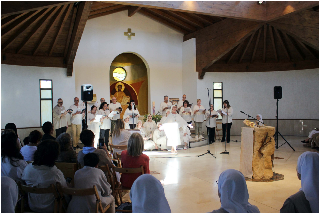
Scene from the oratorio "El Santo Viaje" ("The Holy Journey") performed in the Church of Reconciliation, at the Monastery of the Conversion in Sotillo de la Adrada, Spain.

The audience waited in silence for the oratorio to begin. One of my sisters stepped to the center of the stage and, blowing a ram's horn, produced a sound that seemed to come from ancient times. It was a shofar, an instrument from ancient Jewish liturgy used — among other things — to awaken human beings from spiritual lethargy and draw them inward, to that inner place where they can hear the voice of God.