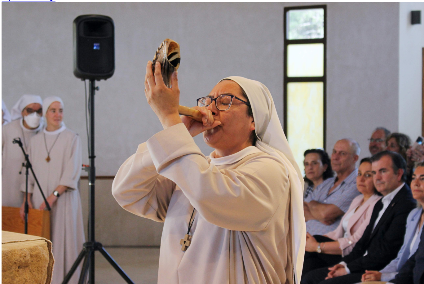
An Augustinian nun from the Monastery of the Conversion playing the shofar at the beginning of the oratorio in Sotillo de la Adrada, Spain.