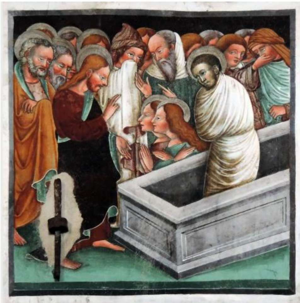
Resurrection of Lazarus - Fresco cycle about the Life of Christ, Oratorio dei Disciplini, Clusone, Lombardy, Italy.